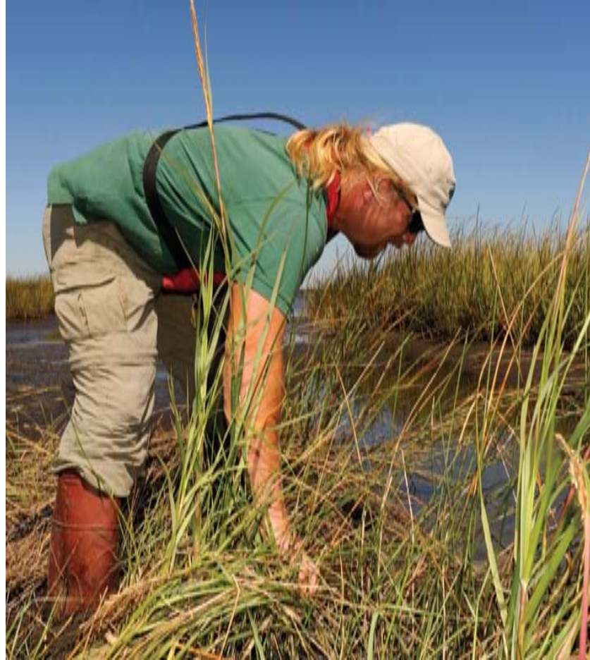
A Shoreline Clean-up Assessment Technique team member from the University of New Orleans checks marsh vegetation for signs of damage from the Deepwater Horizon oil spill.

fore it reached land may have also been injurious to fish and wildlife, although their environmental effects are not yet fully understood. However, the threat that the dispersants pose must be weighed against the benefit of keeping oil from infiltrating critical wetland habitat.” 6