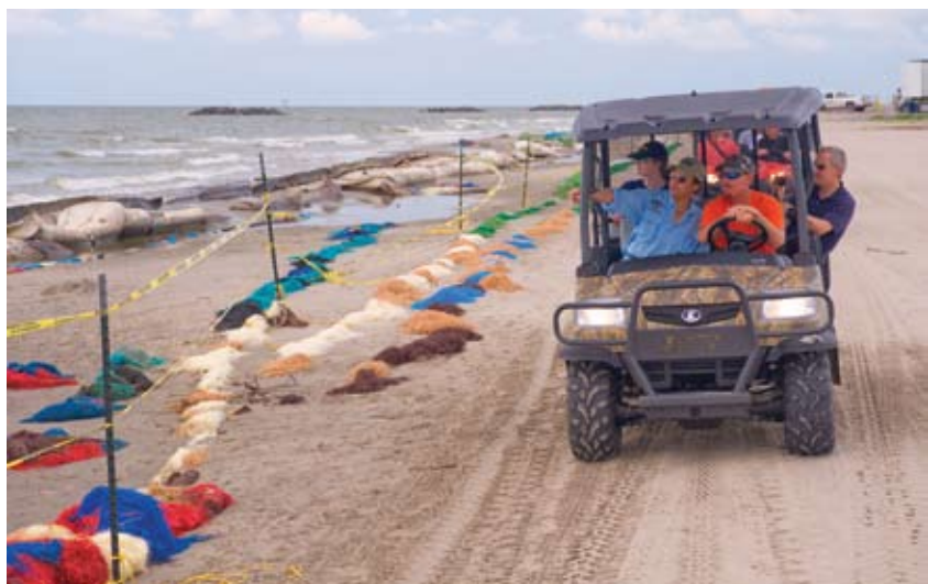
Members of the Gulf Coast Restoration Task Force drive past oil-absorbent pom poms on a survey of coastal beaches.