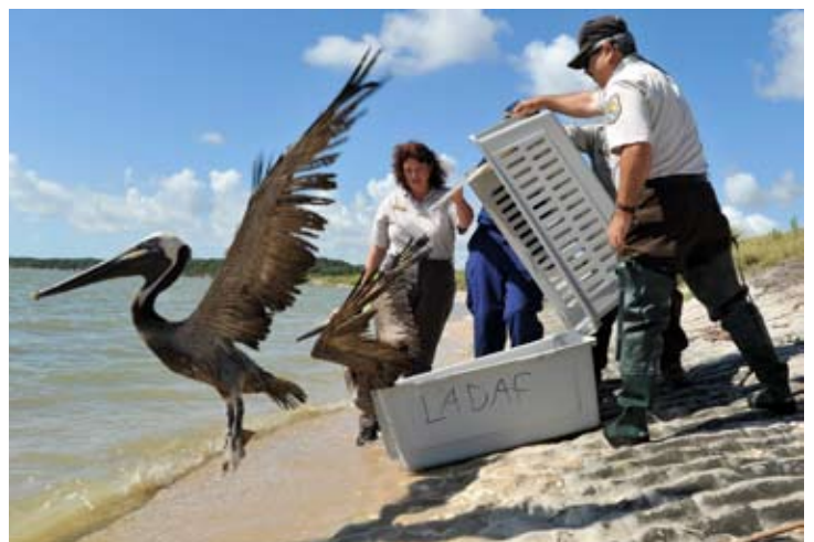
Assisted by wildlife managers, a veterinarian with the U.S. Fish and Wildlife Service releases a cleaned pelican back into the wild.