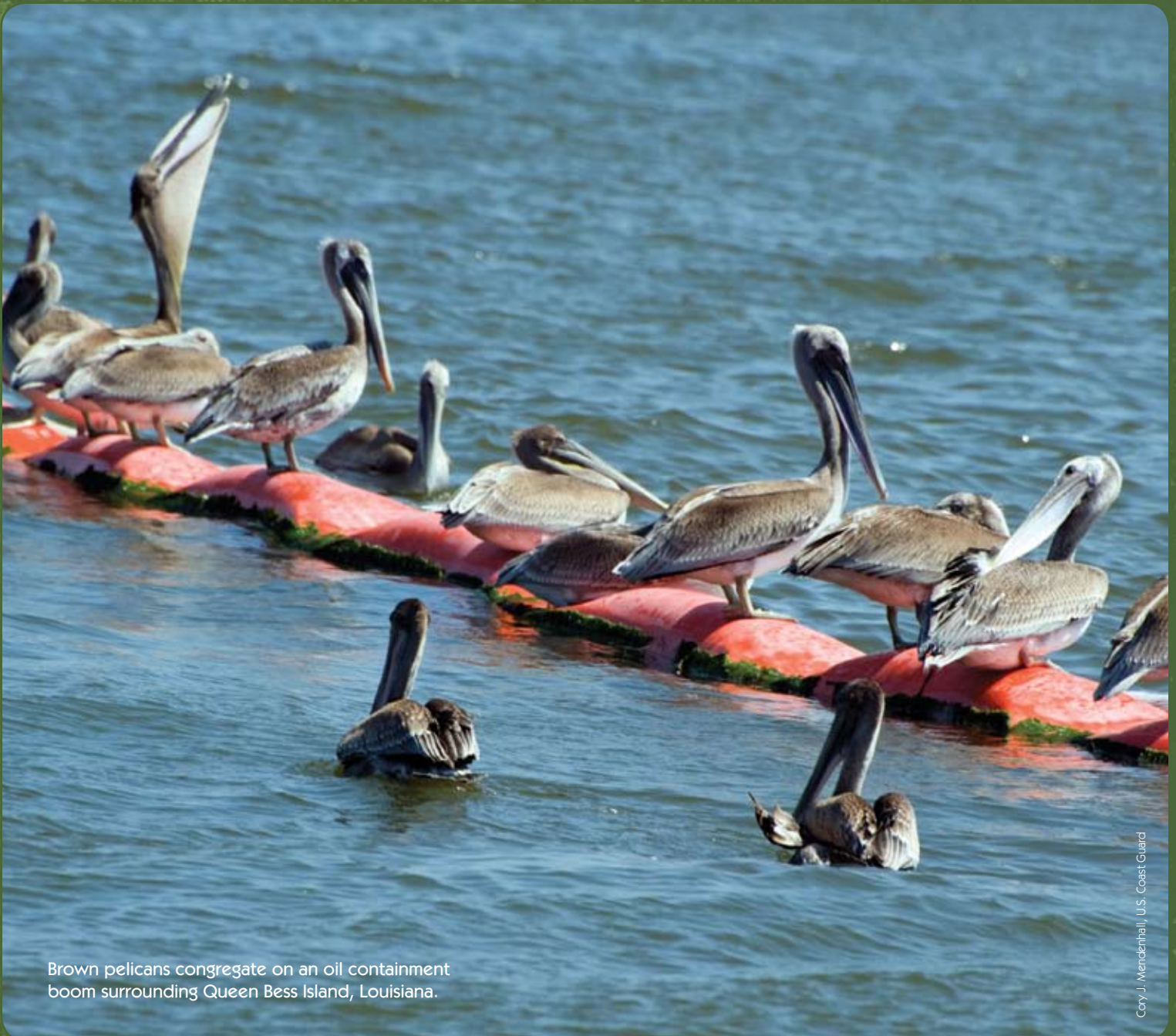
Brown pelicans congregate on an oil containment boom surrounding Queen Bess Island, Louisiana.

First Class Mail Postage and Fees Paid U.S. Army Corps of Engineers New Orleans District Permit No. 80