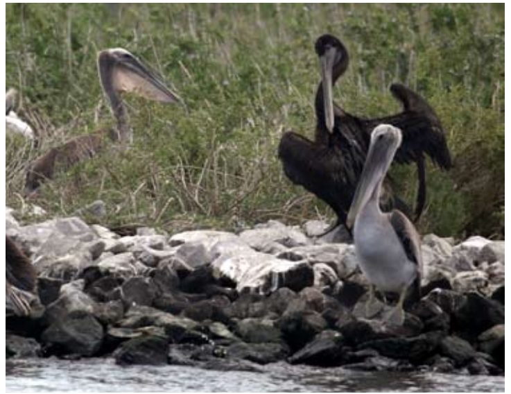
A brown pelican coated with oil stands among other brown pelicans on Queen Bess Island off Grand Isle, La.

Yet cleaning oil out of a marsh risks creating worse problems. Footsteps and equipment can push oil deep into the fragile soil. Cleaning operations can destroy roots and rhizomes that are viable even while appearing lifeless. “If the toxic, oiled sediment is below the root system of the marsh grass, a marsh may be able to recover,” says LeBlanc. “But oil can slow vegetative growth to the extent that the entire marsh