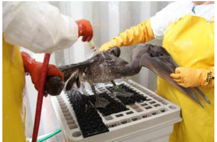
Bird rehabilitation specialists clean oil from a juvenile brown pelican.