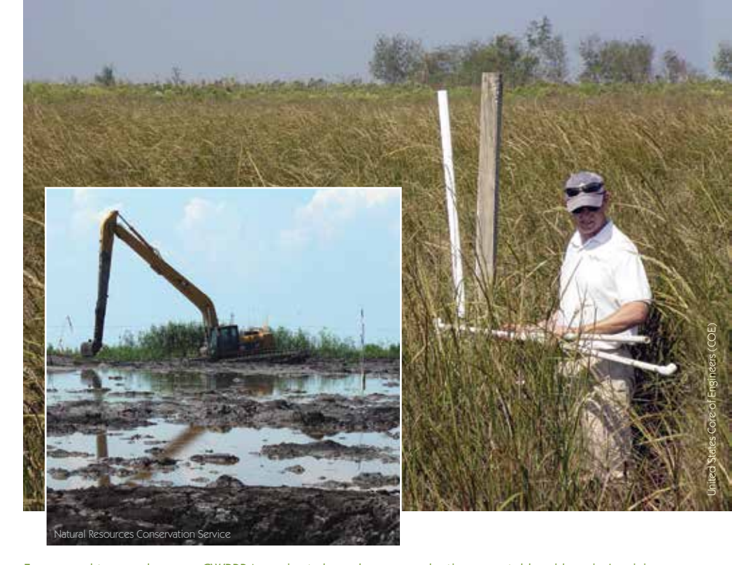
From mud to marsh grass, CWPPRA projects have been combating coastal land loss in Louisiana since 1990. While every restored acre is valued, many of CWPPRA's most notable contributions are intangible: serving as an incubator for developing different restoration approaches, fostering public involvement in project selection and modelling interagency cooperation.

CWPPRA's process of project selection and development promotes transparency and encourages citizens' participation. "CWPPRA has always been a grass-roots, ground-up program," says Roy. "Task Force meetings are open to the public and invite public comment. Anyone – an individual, an organization, a parish, an agency – can nominate