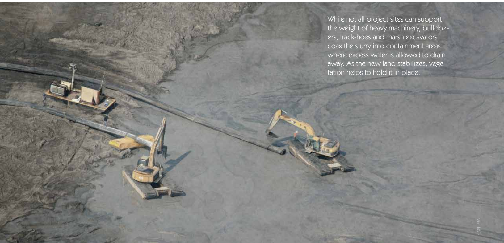
While not all project sites can support the weight of heavy machinery, bulldozers, track-hoes and marsh excavators coax the slurry into containment areas where excess water is allowed to drain away. As the new land stabilizes, vegetation helps to hold it in place.

As Louisiana's plight of wetland loss became more widely known, interest in using dredged material for wetland restoration increased, resulting in changes to laws and policy. In 2007, Congress expanded the mission of the USACE to include environmental restoration along with flood damage reduction and inland and coastal navigation. The changes have given the agency more flexibility in disposing of dredged