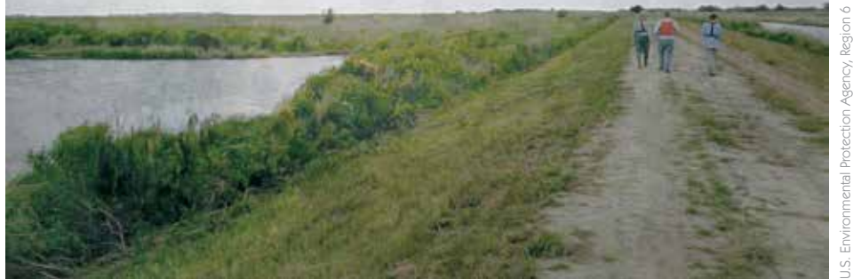
U.S. Environmental Protection Agency, Region 6

16 Excerpts from 25 Years of Past WaterMarks Interviews