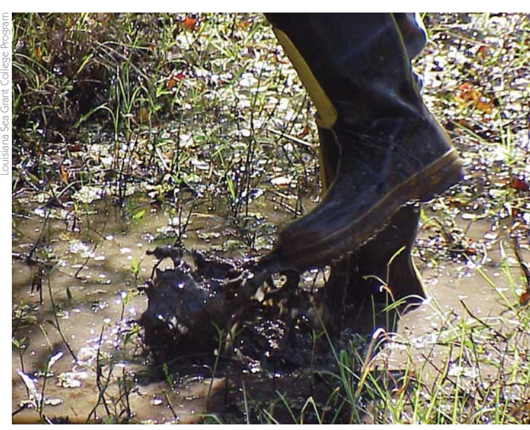
The unconsolidated soil of Louisiana's wetlands can feel bottomless — in many places one can sink chest-deep in mud before there is enough solidity underfoot to arrest the plunge. The difficulty of establishing seedlings in such conditions spurs scientists to devise other planting methods.

But Materne isn't limiting himself to seed. "We're exploiting the plants' own strong suit: vegetative propagation. We're chop-