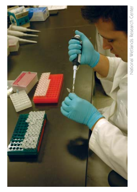
From microscopic examination of cells to mapping with satellite imagery, scientists work together at NWRC to unlock the wetlands' secrets.