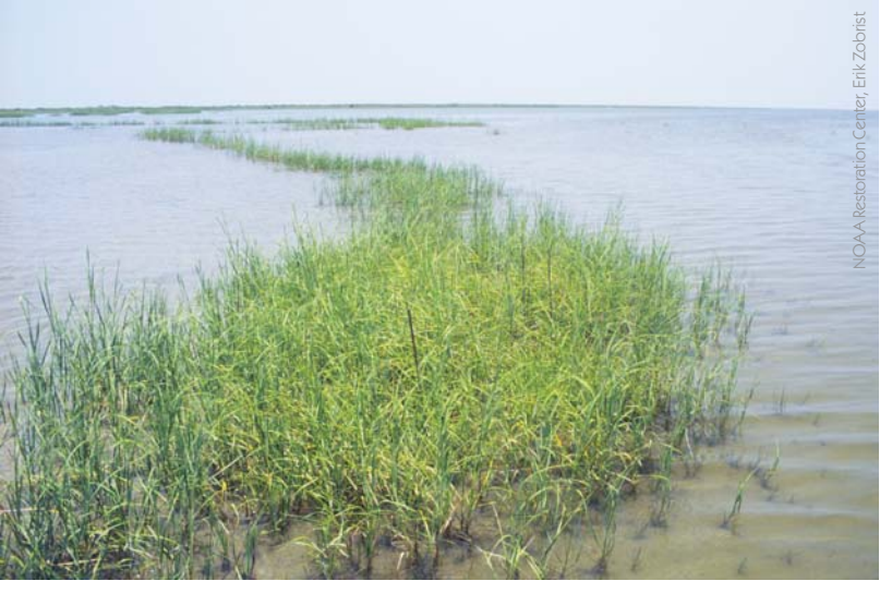
Versatile, hardy and fast-growing, smooth cordgrass is a popular choice for holding soil and stabilizing land. The Chandeleur Islands Restoration Project, shown here, planted smooth cordgrass to stabilize more than four miles of barrier island shoreline.

Because the ecosystem of Louisiana's marshes is so destabilized, plants need help to save the wetlands. Many projects funded by the Coastal Wetlands Planning, Protection and Restoration Act (commonly known as the Breaux Act) involve engineering, such as designing water control structures to regulate tidal flow, stabilizing shorelines