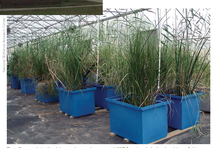
Top: Research in the labs and greenhouses at NWRC not only helps Louisiana fight wetlands loss, but also contributes to understanding the complexities of wetland ecosystems worldwide.

Begun in 1975 as part of the U.S. Fish and Wildlife Service, in 1992 the center moved to the University of Louisiana's research park in Lafayette. Today the NWRC is one of 18 science centers in the U.S. Geological Survey's Biological Resources Discipline. WM