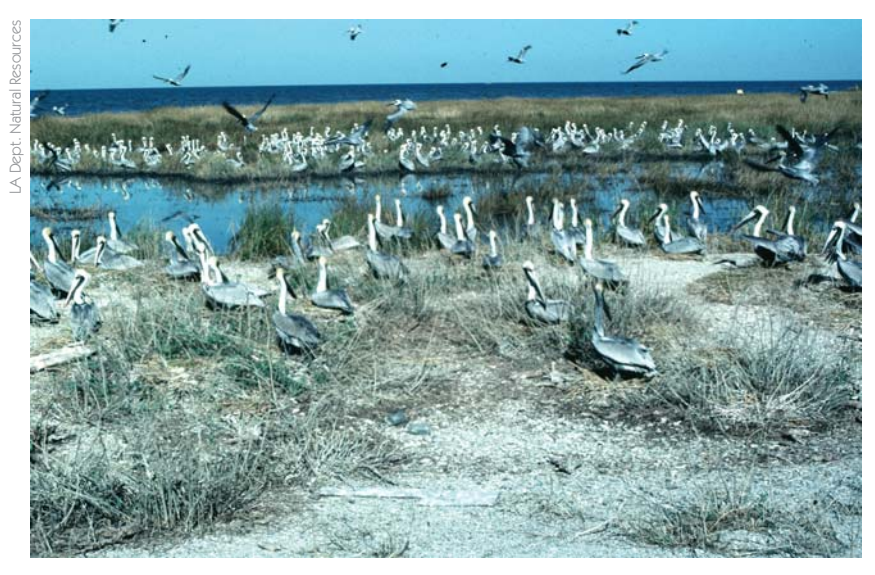
Thanks to habitat restoration projects in coastal Louisiana, the brown pelican is no longer on the U.S. Fish and Wildlife Service's endangered species list.

Twenty years ago the brown pelican, Louisiana's state bird, had vanished from Louisiana's coastal wetlands as DDT pollution endangered its young and erosion claimed its habitat. Following a national ban on the use of DDT, the state reintroduced pelicans from Florida and began