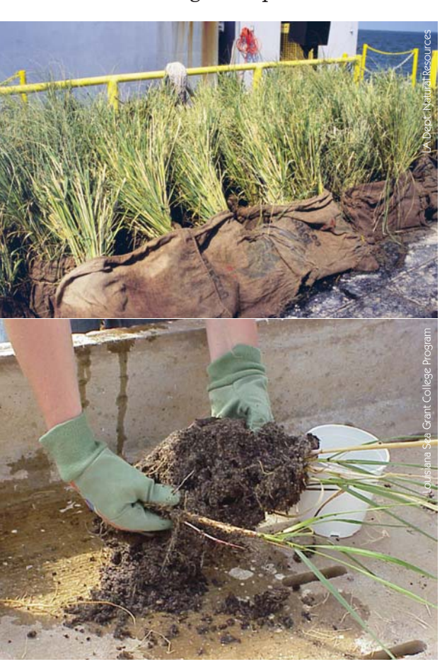
Above: New propagation methods aim to reduce the expense of growing material for transplanting and transporting it to project sites.

Below: Characteristics such as stem density and root mass can be matched to conditions at planting sites.