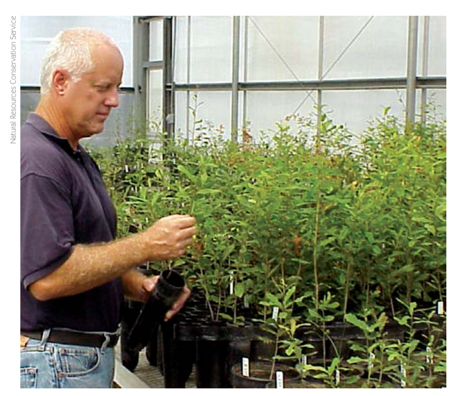
Scientists at the NRCS Plant Materials Center test strains of native species that are particularly adaptive to changing conditions in the wetlands. Only after careful, thorough testing is a superior strain identified and released as a proven performer.

Furnishing the seeds, propagules and foundation plant material that private nurseries use to raise these strains, the PMC is also providing a readily available supply of plant materials for restoration efforts