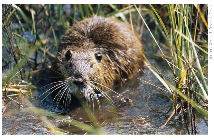
Plants provide food and shelter to wetland creatures from microbes to mammals. Exotic nutria eat marsh plants' stems, leaves and seeds, sometimes destroying the vegetation's regenerative capacity. In such instances, hand planting can give nature a boost by re-establishing plant communities.

"Think of sediment in a new CWPPRA project as