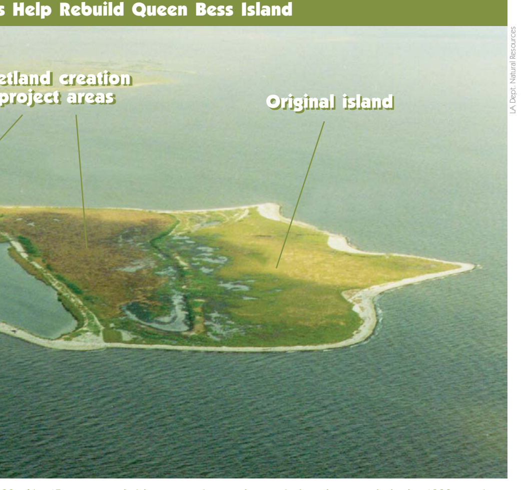
28 of its 45 acres to subsidence, erosion, and storm-induced overwash. In the 1990s, projects d the island's size to 34.6 acres by building rock containment structures and depositing ix Act partners followed. "The material deposited on the island was very silty, soft, mucky soil," by trap sediment, accumulate biomass and help the soil consolidate."

To re-establish Sabine's wetlands, one recent project (Sabine Refuge Marsh Creation, Cycle 1) created marsh from open water areas by building temporary earthen containment dikes, then filling the areas between them with material dredged from the Calcasieu Ship Channel. The perimeter of the area and the edges of trenasses — man-made bayous permitting the natural movement of water and wildlife — were planted with smooth cordgrass, which holds the sediment in place and helps create a functioning marsh as it spreads to the interior of the dredged material.