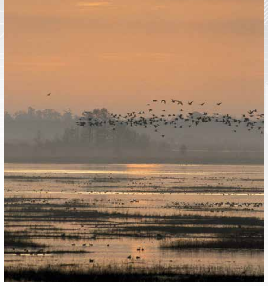
As changing environmental conditions pose challenges to waterfront communities across the globe, Louisiana's coastal specialists are sharing their knowledge and experience to help people protect and restore healthy, enduring wetland habitats.

Right now the discussion about how to pay for restoration and protection is taking place