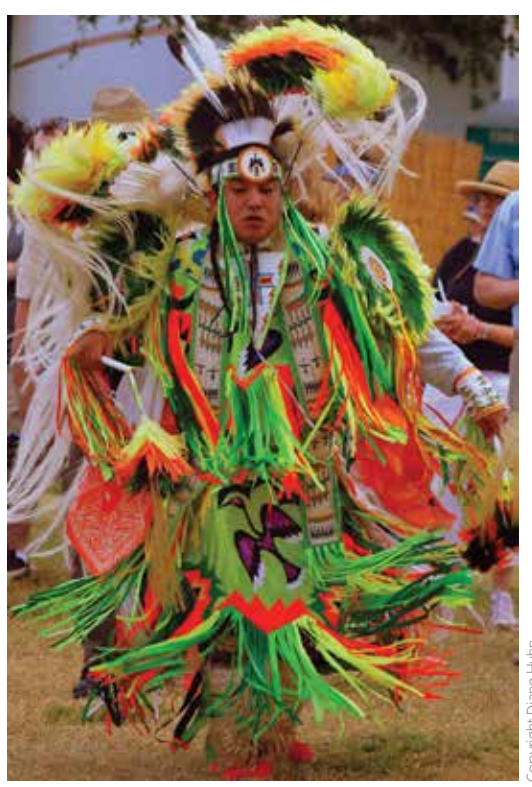
Let's parade! While Louisianans look for opportunities to take to the street all year round. Mardi Gras is the most famous celebration, inspiring elaborate floats, masks and costumes. Native American motifs inspire this dancer's attire of swirling feathers and stylized depictions of birds.

New Orleans' Mardi Gras festival on Fat Tuesday is the city's largest and best