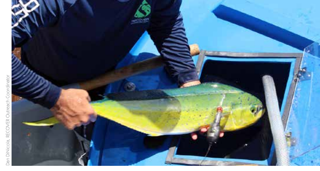
The disaster opened opportunities for scientists to conduct research on oil's effects on marine and coastal ecosystems. Pop-up satellite archival tags capture data on fish's depth, migration and spawning in the wild as well as on water temperature. Results are compared to fish exposed to oil in a laboratory setting.

The oil spill injured marine organisms throughout the food chain, from bacteria to large, predatory fish. Damage assessment specialists estimated the oil killed billions of larval fish. Individual fish directly exposed to