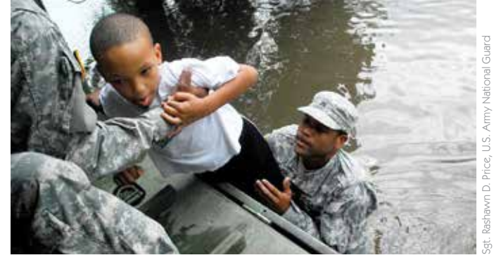
Populations that have experienced past trauma, such as hurricane evacuations and displacement and loss of jobs and income, tend to be more psychologically vulnerable to future disasters. Community resilience programs help people prepare for and rebound from the next incident, while close community ties reduce stress on families and individuals.

People whose culture and livelihoods were closely tied to threatened or damaged natural resources, such as fisheries, reported more mental and emotional difficulties and recovered from the spill more slowly than did other coastal residents. Following a decade of hurricanes that damaged property and disrupted traditions, facing rising sea levels and receding shorelines, even some multi-generational swamp dwellers decided it was time to leave the bayous.