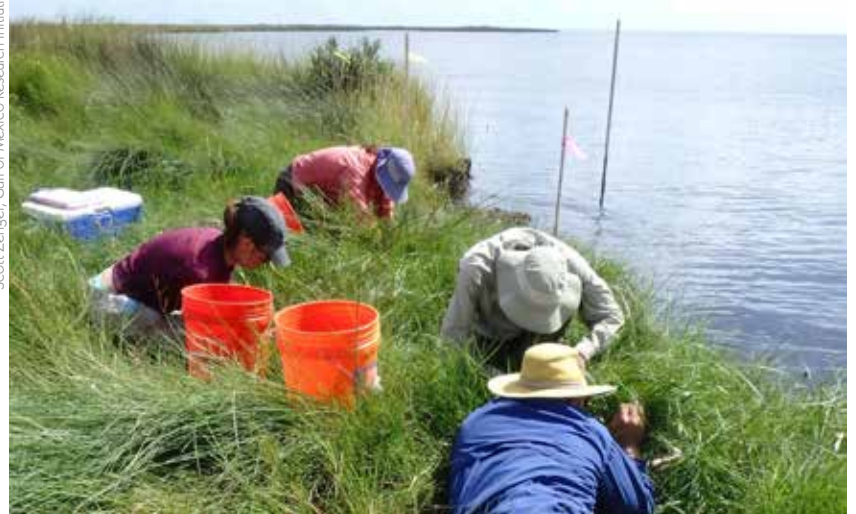
Natural resource recovery efforts following the oil spill were hampered by lack of adequate baseline data for the vast and complex Gulf of Mexico ecosystem. Although some scientific research received funding through oil spill fines and penalties, a much larger, ongoing investment is needed to understand how an oil spill affects the ecosystem and all its denizens.

t Zengel, Gulf of Mexico Research Initiative