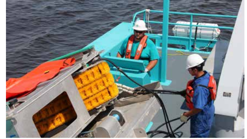
Improvements in oil spill response and in well capping technology were mandated by federal agencies following Deepwater Horizon. While some measures to increase the safety of offshore drilling have been taken, action on other recommendations has been slow, even sometimes going backwards.

Boesch : The commission's work helped push the RE-STORE Act through Congress, which stipulated that 80 percent of fines and penalties resulting from the Deepwater Horizon spill be dedicated to the recovery and protection of the Gulf Coast's natural resources, wildlife, ecosystems and economy. Restoration activities have prioritized making a difference on the ground. Not much money has been allocated to research or to modeling restoration options - except in Louisiana. CWPPRA's years of experience and the trove of data