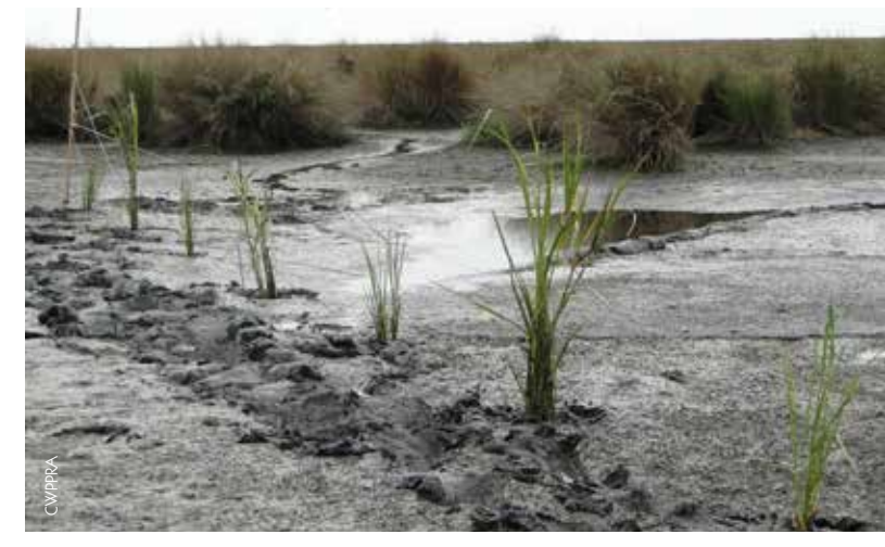
Plants are essential components in stable, functional marshes. Although thin reeds of newly planted marsh grass may appear to be more hopeful than effective, revegetating a project area taps into the power of nature to heal an ecosystem and boosts the chances of the project's success.