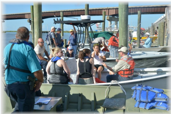
Reporters prepare for a day in the field.

The morning tour departed from Empire, LA to the barrier shoreline of Pelican Island. Reporters visited the Barataria Barrier Island Complex Project: Pelican Island to Pass La Mer to Chalant Pass Restoration (BA-38). The Pelican Island project's construction phase was completed in 2012. Reporters arrived on the back side of the island and noticed that the plant community has naturally vegetated the marsh platform.