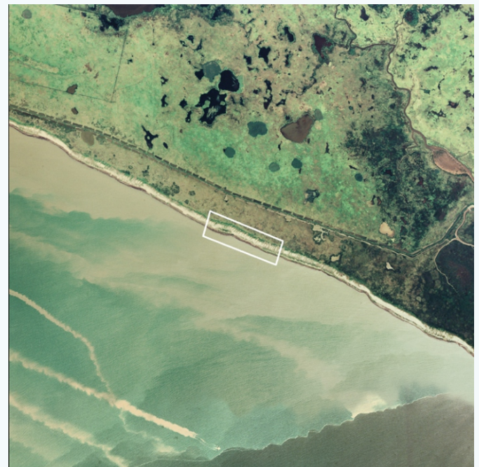
Bio-Engineering Oyster Reef Demonstration (LA-08).

Like most ecosystems, coastal Louisiana is a dynamic environment. Responding to impacts caused by both natural and engineered elements, Louisiana's coastal wetlands either adapt to or are swept away by larger forces. Restoration solutions must adapt to changing conditions or risk becoming useless. Over the course of 20 years, the CWPPRA program has had to adapt to