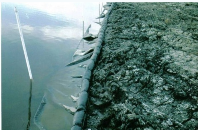
Sediment Containment System for Marsh Creation Demo (LA-09)

The CWPPRA demonstration program provides an opportunity to investigate new technologies to do exactly this. Each year as part of the project selection process, demonstration projects are nominated on the basis of new technology meeting the following three criteria: (1) it has not been fully developed for routine application, (2) the results are transferable, and (3) the technology is not duplicative. Although demonstration projects are not selected every year, many have been funded. Thoroughly studied to gauge their ability to advance wetland restoration, demonstration projects have tested a variety of new approaches to restoration in hopes of enhancing known techniques and improving performance. These projects have included testing new materials for shoreline protection that may be more suitable for Louisiana's soft soils and testing new ways of dredging and containing sediment used in marsh creation projects. Other projects have involved new approaches to vegetative plantings and techniques for regenerating delicate floating marshes. If a project shows promise, it may be scaled into a larger project that is further studied for applicability coastwide. The success of the demonstration program as a whole is found in members of the public who have been able to introduce their inventions and concepts and in agencies who have