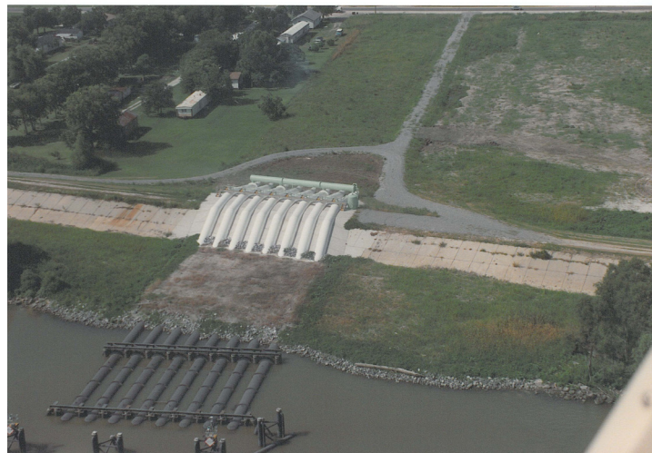
West Pointe a la Hache siphon's levee crossing and intake on the west bank of the Mississippi River.

Proposed siphon improvements include: on-site and remote instrumentation to provide continuous monitoring and measurement of actual flow rates; remote instrumentation to provide instant notification when any pipes lose their prime, and thereby initiate immediate response to re-establish the vacuum; on-site vacuum pump, control equipment, and instrumentation to immediately re-establish flow when any pipes lose their prime; and an air release system to allow escape of accumulated gases to maintain the siphon vacuum.