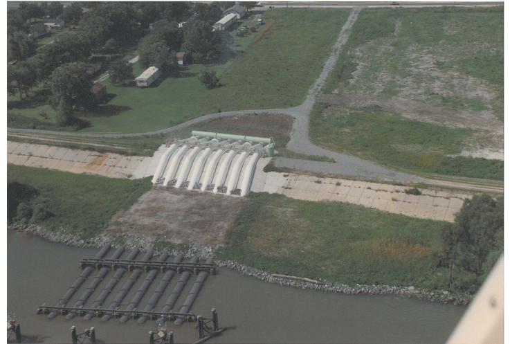
West Pointe a la Hache siphon's levee crossing and intake on the west bank of the Mississippi River.

Proposed siphon improvements include: on-site and remote instrumentation to provide continuous monitoring and measurement of actual flow rates; remote instrumentation to provide instant notification when any pipes lose their prime, and thereby initiate immediate response to re-establish the vacuum; on-site vacuum pump, control equipment, and instrumentation to immediately re-establish flow when any pipes lose their prime; and an air release system to allow escape of accumulated gases to maintain the siphon vacuum.