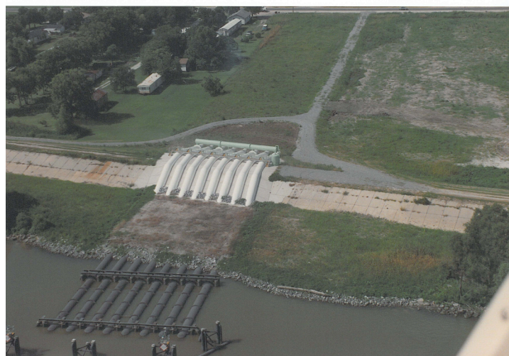
West Pointe a la Hache siphon's levee crossing and intake on the west bank of the Mississippi River.

Proposed siphon improvements include: on-site and remote instrumentation to provide continuous monitoring and measurement of actual flow rates; remote instrumentation to provide instant notification when any pipes lose their prime, and thereby initiate immediate response to re-establish the vacuum; on-site vacuum pump, control equipment, and instrumentation to immediately re-establish flow when any pipes lose their prime; and an air release system to allow escape of accumulated gases to maintain the siphon vacuum.