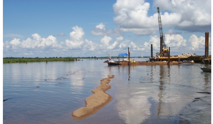
In order to prevent the heavy rock riprap from settling too deep in the organic soil, geo-textile cloth was first put down and used as a base.

This project was coordinated with the U.S. Army Corps of Engineers maintenance-dredging program to provide beneficial use of dredged material by placing it behind the armored levee in order to create new marsh. Construction was completed in November 2000. The O&M Plan was signed in July 2002. This project is on Priority Project List 4.