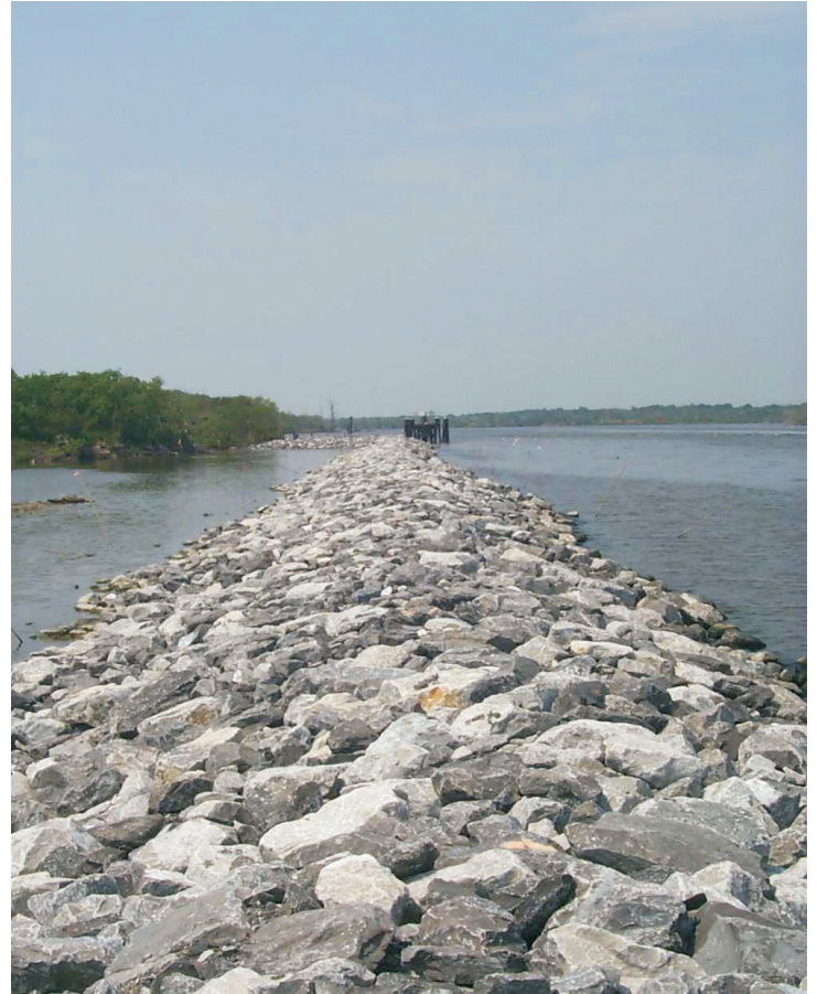
Protection was provided to a total of 41,000 feet of shoreline in order to preserve the effectiveness of these areas in preventing marsh loss.

This project is on Priority Project List 9.