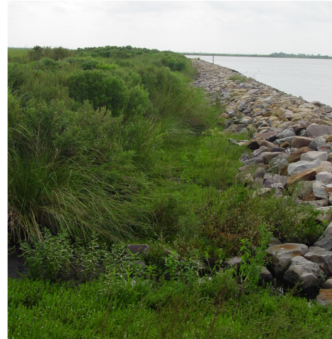
This photo illustrates the rock revetment protecting the vegetative shoreline.

This project was selected for Phase I (engineering and design) funding at the January 2002 Breaux Act Task Force meeting. Project construction was completed in 2005. It is included as part of Priority Project List 11.