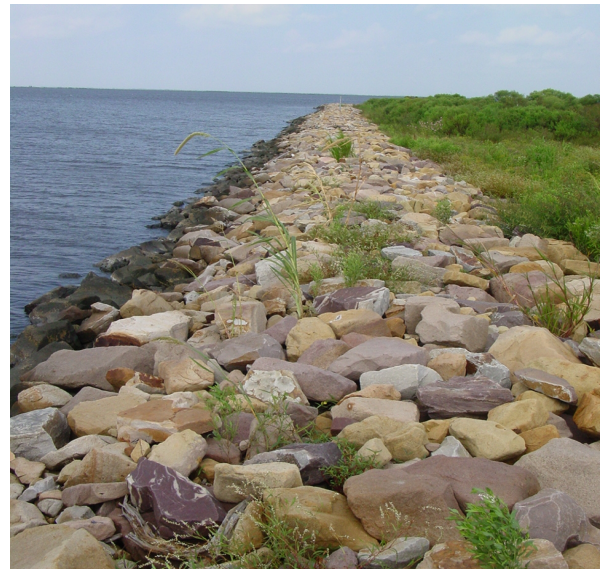
Five years after construction, the constructed rock revetment has proven to be very effective at eliminating shoreline erosion.

For more project information, please contact: