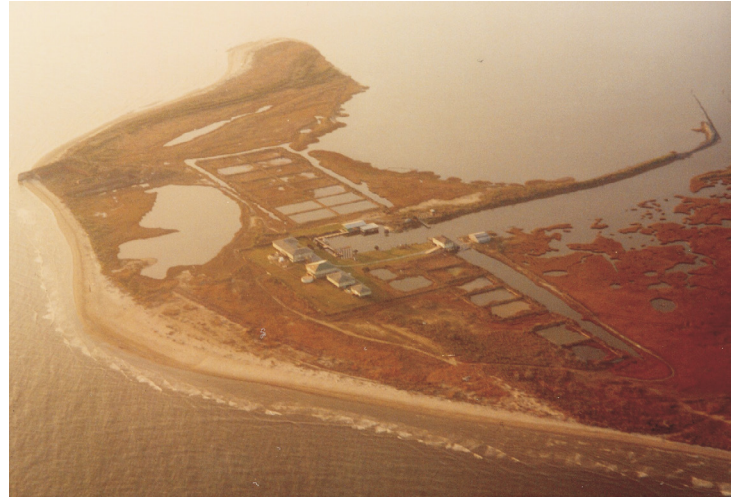
Aerial view of the Lyle S. St. Amant Marine Biological Laboratory on west Grand Terre Island.

This project is listed on Priority Project List 9.