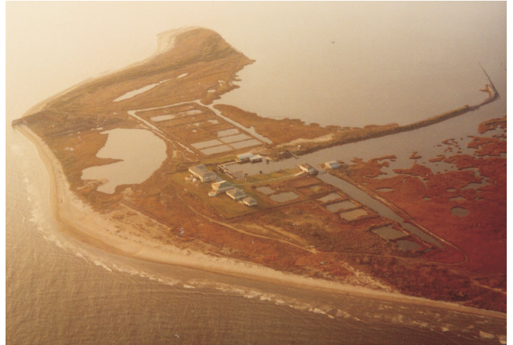
Aerial view of the Lyle S. St. Amant Marine Biological Laboratory on west Grand Terre Island.

This project is listed on Priority Project List 9.