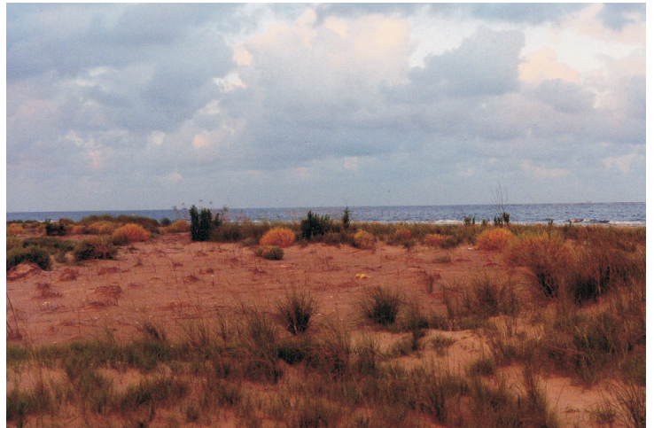
Barrier island habitat such as this will be restored with this project.