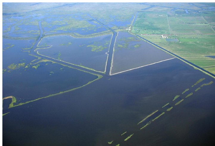
Aerial view of Bayou Dupont.

The Bayou Dupont project represents the first example of pipeline transport of sediment from the river to build marsh as a CWPPRA project. Results from this project helped demonstrate the value and efficacy of greater use of pipeline-conveyed river sediments for coastal restoration.