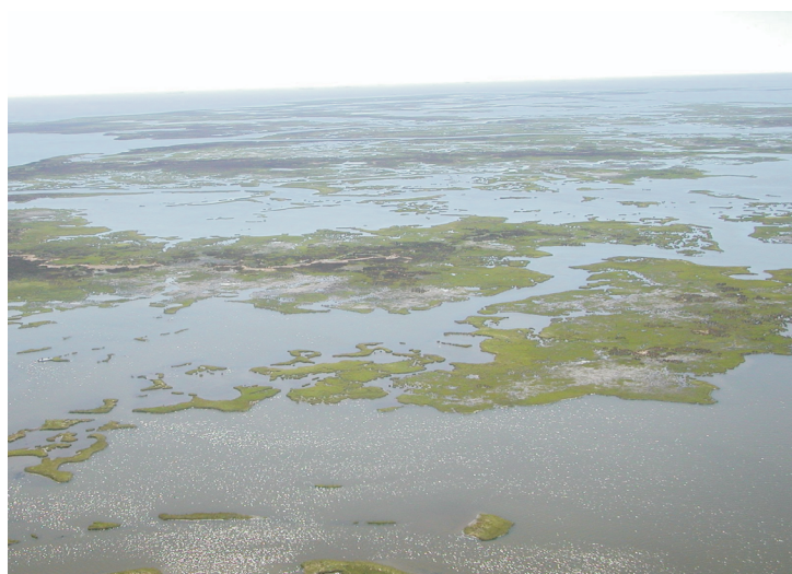
This project will help restore the highly degraded marshes of the area.

The historically intermediate to brackish marshes in the area have completely converted to a brackish classification. These marshes are deteriorating due to a lack of freshwater input. A siphon built in 1963 at White Ditch that used to deliver the fresh water and sediment needed to maintain the area's wetlands has ceased operation due to age and various other complications. The natural banks of River Aux Chenes block any fresh water that may be provided by the Caernarvon Freshwater Diversion, a water control structure north of the project area. Currently, rainfall provides the only source of freshwater input to the area.