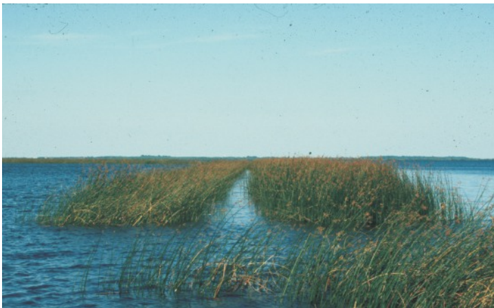
California bulrush plantings after prolonged exposure to elevated salinity levels.

In June 1994, 4,750 California bulrush ( Schoenoplectus californicus ) plants were installed along 11,875 linear feet of marsh shoreline to protect against wave erosion.