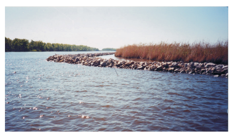
Limestone riprap was placed within a 4.3 mile reach along the north bank of the GIWW between the Vinton Drainage Canal and Perry Ridge.