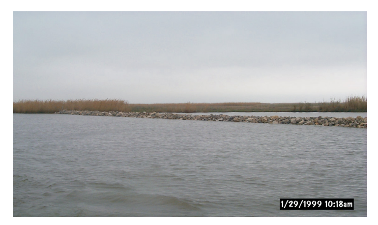
Rock riprap which can withstand the destructive forces of wave energy helps to maintain the integrity of the shoreline.

This project is on Priority Project List 4.