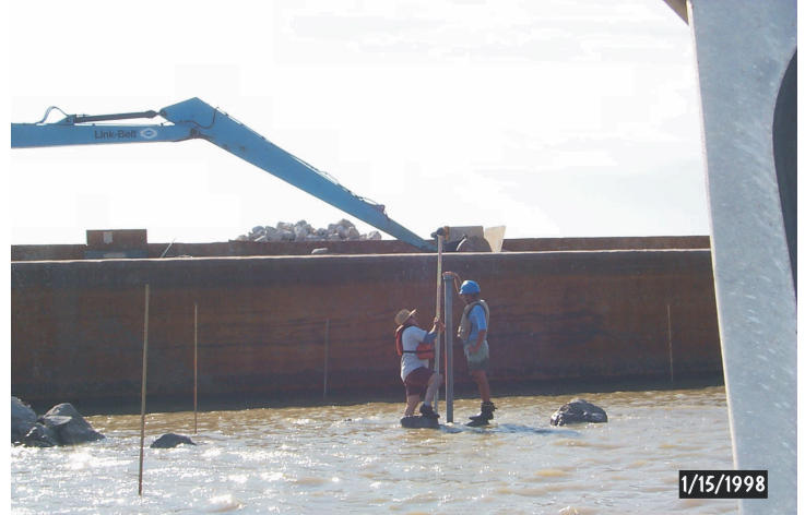
Settlement plates such as the one pictured here will be used to determine if settling of the structure has occurred. Technicians from NRCS's Crowley Watershed Office are shown taking baseline elevations before more rock is deposited. Future elevation readings will be taken after the structure is completed.

This project is on Priority Project List 9.