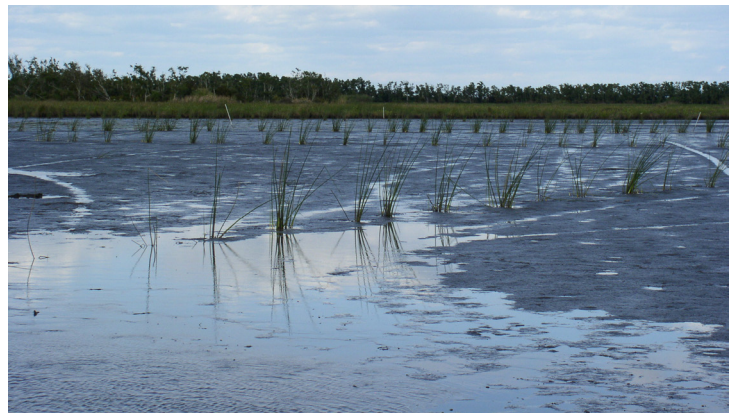
An example of vegetative plantings in interior marsh areas.