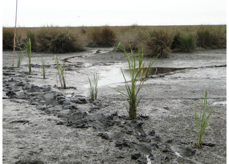
Recently planted vegetation at the LA-39 project site at Marsh Island.

This project is on Priority Project List 20. Three sites have been planted with Year One funding, and three sites are scheduled to be planted in 2014 with Year Two funding.