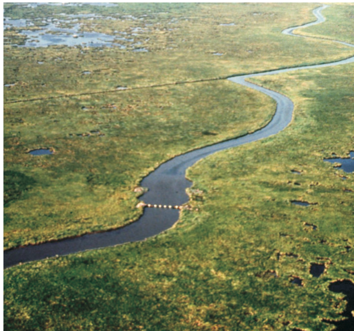
Perimeter structures, such as the one shown above, and other project features will be used to restore hydrology in the project area.

This project is on Priority Project List 9.