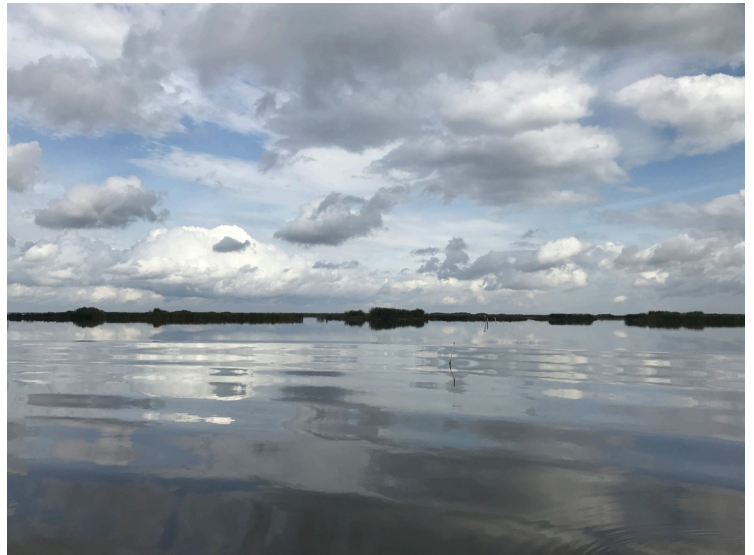
Large open water areas that were historically intermediate marsh are the focus for restoration.

Project features include creating and/or nourishing approximately 428 acres of marsh (291 acres of marsh creation and 137 acres of nourishment) in two marsh creation areas using dedicated dredged material from the Gulf of Mexico. The dredged material would be fully contained, and containment dikes will be degraded as necessary to reestablish hydrologic connectivity with adjacent wetlands. In case the area does not re-vegetate on its own, the maintenance cost estimate will include funds to plant 25% of the created marsh at Year 3. The project will restore the marsh platform and work synergistically with the NAWCA funded Freshwater Bayou Shoreline Stabilization project and the Freshwater Bayou Wetlands Protection (ME-04) project.