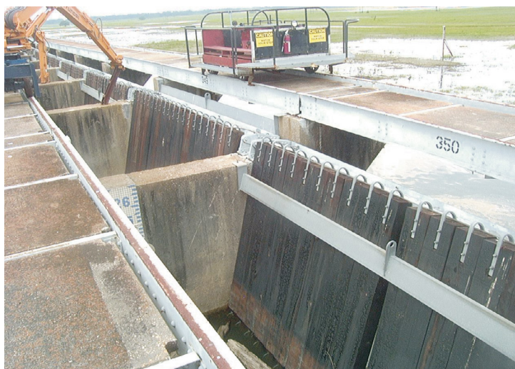
The Bonnet Carre Spillway timber pins will be pulled for opportunistic use of the structure.

Lake Pontchartrain has become more saline since construction of the Mississippi River Gulf Outlet (MRGO). Since 1963, over 30,000 acres of marsh in the Pontchartrain Basin have converted to a more saline marsh type. This higher salinity is stressing marshes and adjoining swamps and, in all probability, increasing their loss rate. The area around Bayou LaBranche lost 4,640 acres of wetlands between 1932 and 1990. Over 70% of this loss was between 1956 and 1974, the period when the MRGO and Interstate 10 were built and Hurricane Betsy inundated the area. The project area is estimated to lose an additional 340 acres over the next 20 years without remediation.