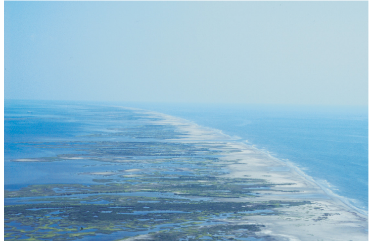
Aerial view of the Chandeleur Islands.

The purpose of this project is to provide stabilization to 364 acres of unvegetated washover deposits on 22 overwash fan sites through smooth cordgrass ( Spartina alterniflora ) plantings. These plantings should complement the natural colonization that often occurs on these overwash deposits. Increased percent cover of vegetation on these deposits should allow for the maintenance and accretion of back barrier marshes through sediment trapping.