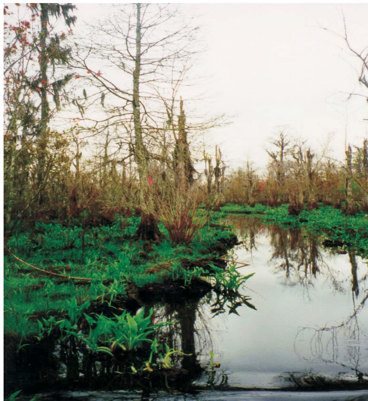
The Maurepas Swamp in decline.

The project's main structural features will include: two 10x10 box culverts capable of diverting 2,000 cubic feet of water per second; a 100x100 foot receiving pond reinforced with a 20-inch layer of riprap; and a 50-foot wide, 10-foot deep outflow channel roughly 27,500 feet long that will run from the river to U.S. Interstate 10.