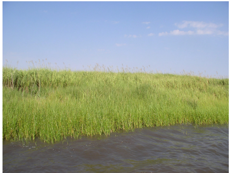
Protecting the Alligator Bend shoreline will limit incursions of open water into interior marshes.

This project is on Priority Project List 16.