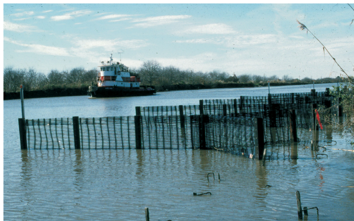
One of the six types of wave-damping structures tested for their ability to protect the canal's shoreline.

The Comprehensive Monitoring Report of June 2000 reported that none of the vegetative plantings survived the period of study. Likewise, although the structures remained in place, subsequent shoreline erosion rates were not reduced. Monitoring has ceased, and the Comprehensive Monitoring Report was accepted by the sponsoring agencies as the closeout report. This project is on Priority Project List 1.