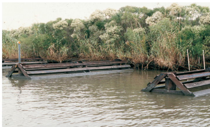
Another one of the six designs tested in the shoreline protection study.