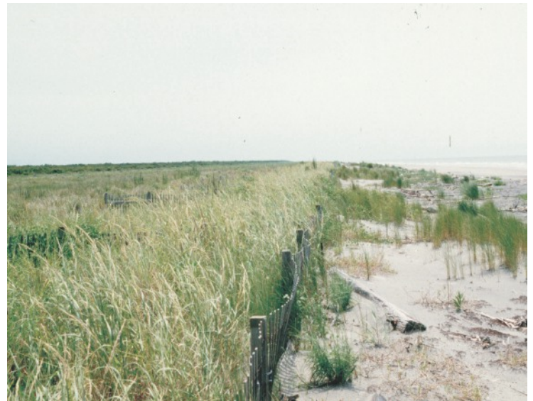
After one year of monitoring vegetation is becoming established on dunes.

The project's goals are to help maintain the integrity of the barrier island through use of the sand fencing and vegetation to help prevent loss of elevation, breaching of the island and erosion from wave action, especially during tropical storms and hurricanes.