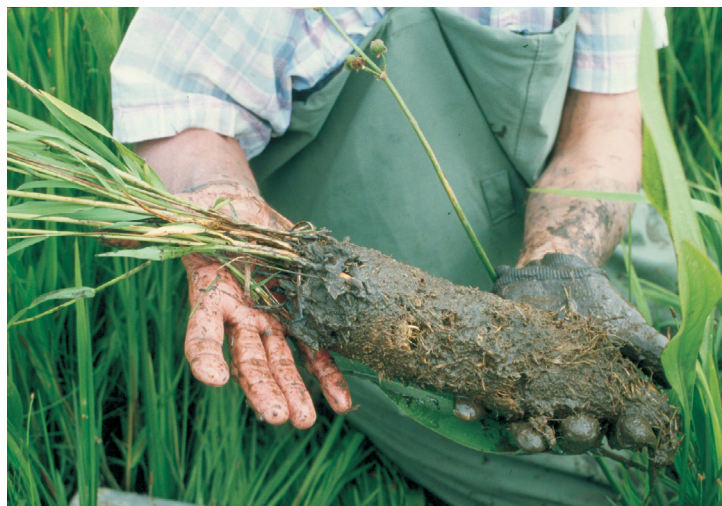
Plugs are harvested from healthy, thick-mat maidencane floating marsh for transplanting into thin-mat floating marsh.

Project implementation increased knowledge about floating marshes and helped identify management techniques for potential large-scale applications.