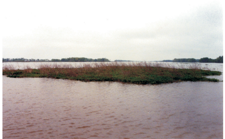
Large mats of floating freshwater marsh, such as this one, detach from their point of origin and enter the GIWW through large breaches in the existing shoreline.

This project is on Priority Project List 10.