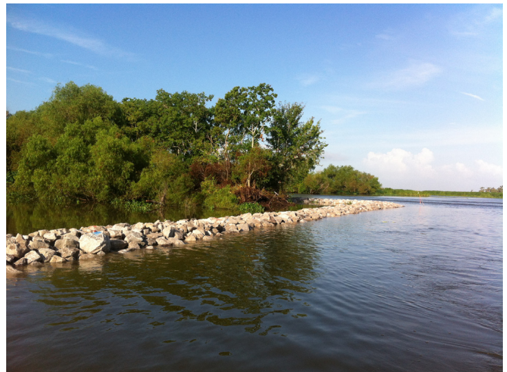
Typical section of forshore rock dike construction as viewed from the GIWW near Copesaw Canal. The typical rock construction includes a lightweight aggregate core to prevent the structure from sinking in these soils that are very organic and have very low load-bearing.