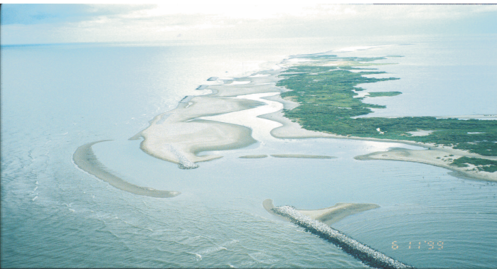
Sand deposits or "tombolos" have developed behind the breakwaters that protect and enhance the island. A less dramatic, however still positive effect, is expected to occur behind the 8 additional breakwaters being constructed to the west of the existing breakwaters.