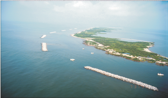
Rock breakwater construction for the prior demonstration phase of this project was completed on the east end of the island in June 1997. Taken immediately after construction was complete, this 1997 photograph shows no sand behind the breakwaters.

The project is located in the Terrebonne Basin on the western-most island of the Isles Dernieres barrier island chain in Terrebonne Parish, Louisiana.