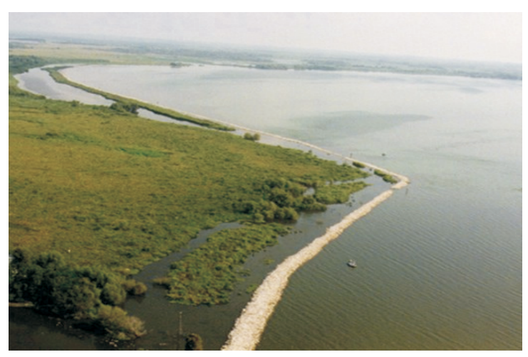
A foreshore rock dike, such as the one shown above, may provide an alternative type of shoreline protection to the eastern shoreline of East Cote Blanche Bay.

This project is on Priority Project List 13.