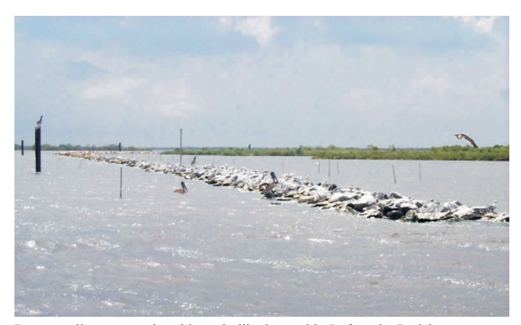
Brown pelicans are using this rock dike located in Lafourche Parish.

For \ more \ information, \ please \ contact: