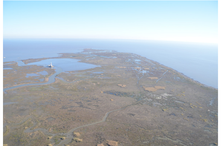
Aerial photo of the project taken on December 17, 2012 after construction, looking Northeast. Provided by the Louisiana Department of Wildlife and Fisheries.