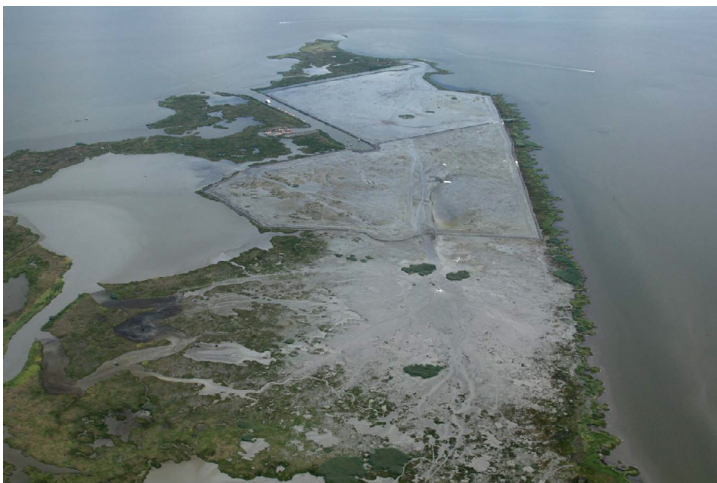
Aerial photo taken on August 1, 2010 during construction, looking Northeast.

This project was designed to re-create and nourish brackish marsh habitat within areas that experienced hurricane damage. The project created 363 acres of marsh and nourished an additional 665 acres. Future loss rates for the interior ponded areas are estimated to be reduced by 50 percent. This project provides a synergistic effect with CWPPRA's Marsh Island Hydrologic Restoration (TV-14), a project constructed in December 2001.