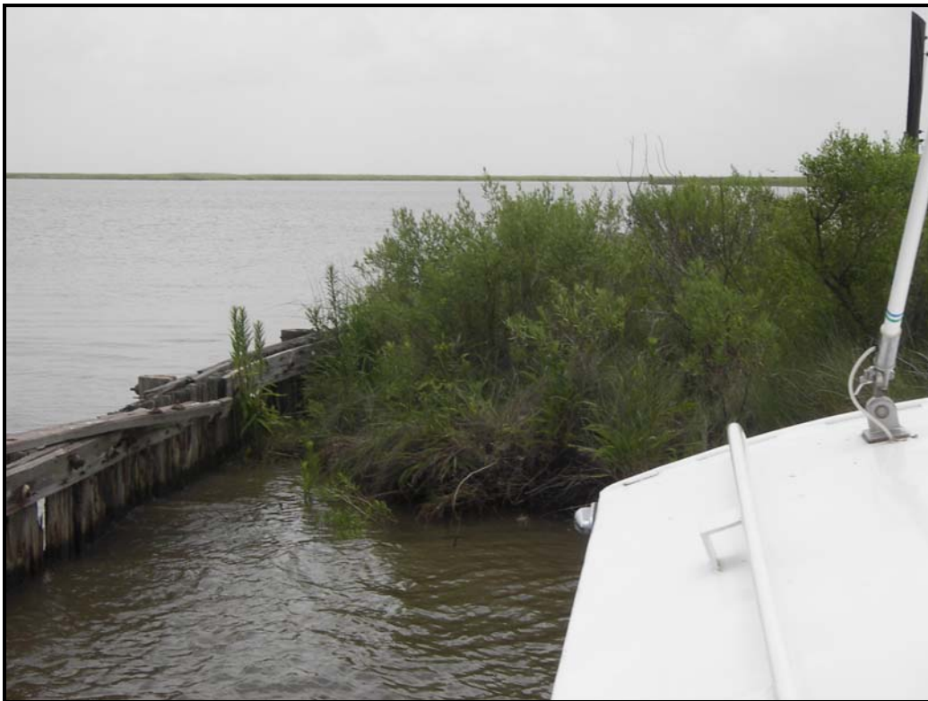
Photo 6, Area 3, Showing erosion along west side of timber bulkhead. (June 19, 20