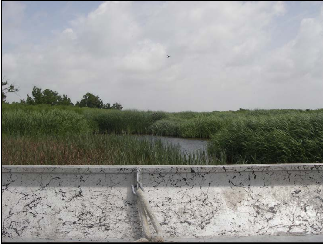
Photo 1, Area 1, Note vegetation is 90-95 % covered. (June 19, 2007)