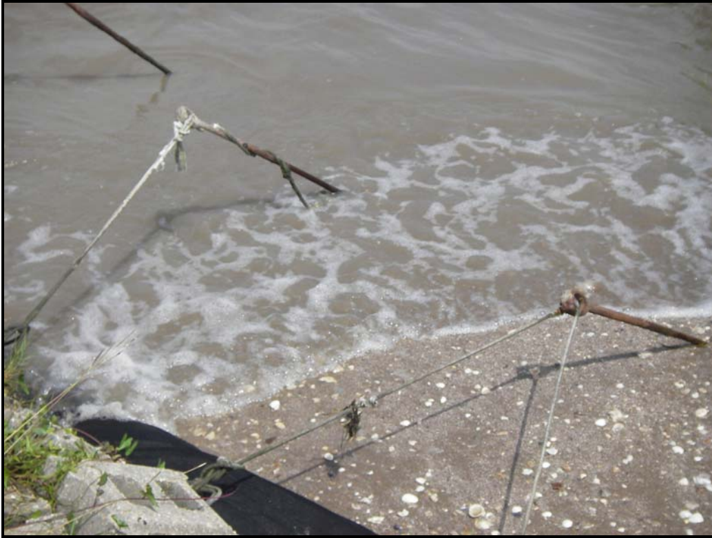
Photo 3, Area 2, Close up view of erosion on west side of concrete mats. (June 19, 2007)