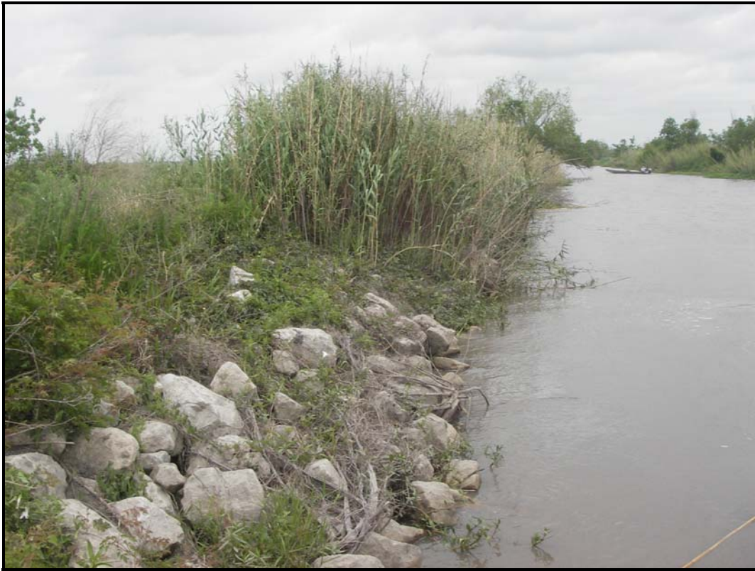
Photo 3, Tie-in to North Prong Ditch