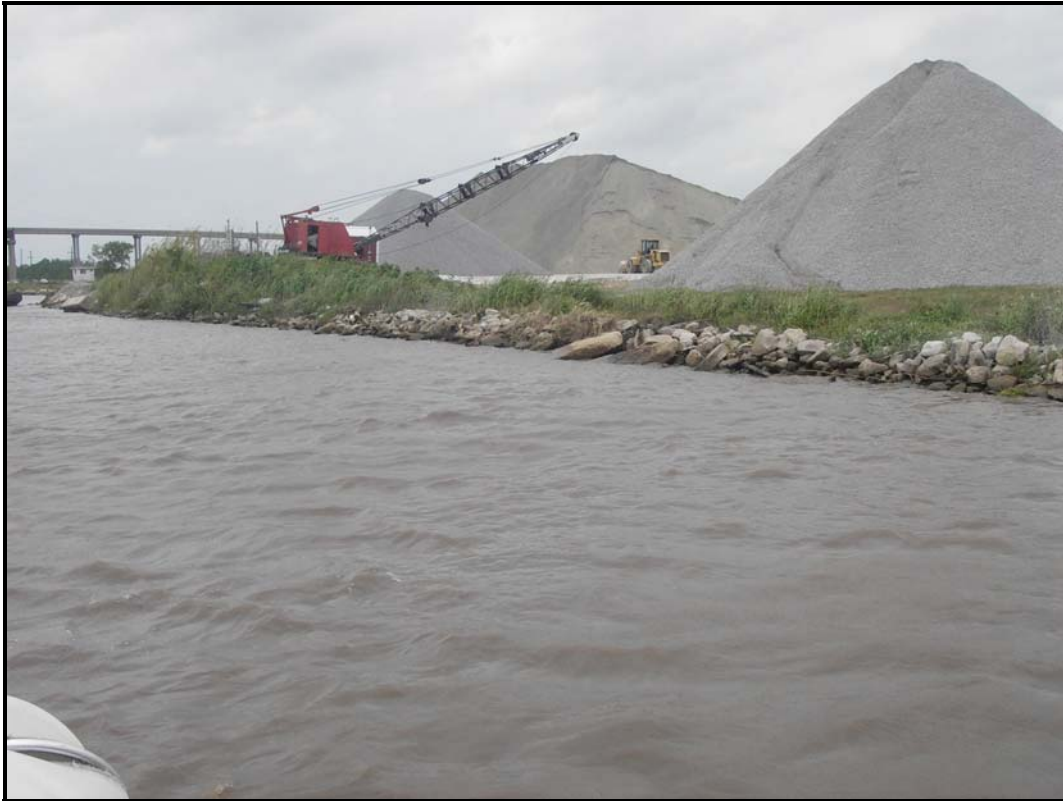
Photo 1 , western tie-in along north bank of GIWW