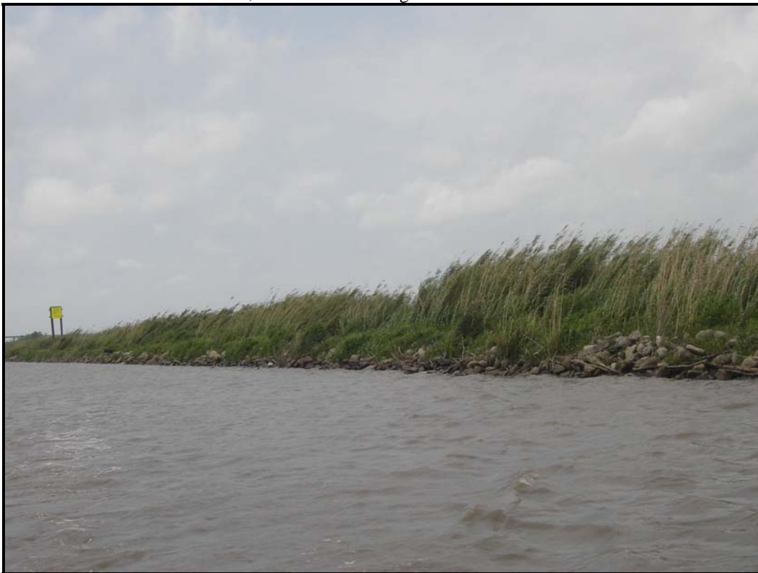
Photo2 , Typical foreshore dike section.