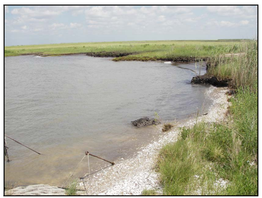
Photo 3, Area 2, Close up view of erosion on west side of concrete mats.