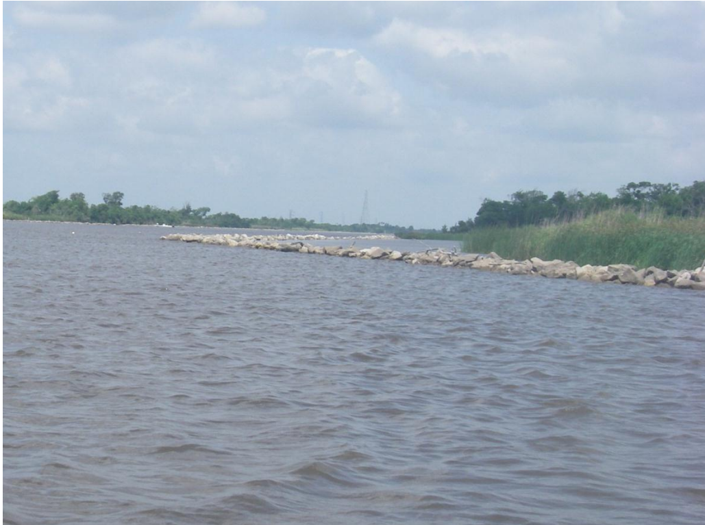
Photo No.1, Typical Rock Dike