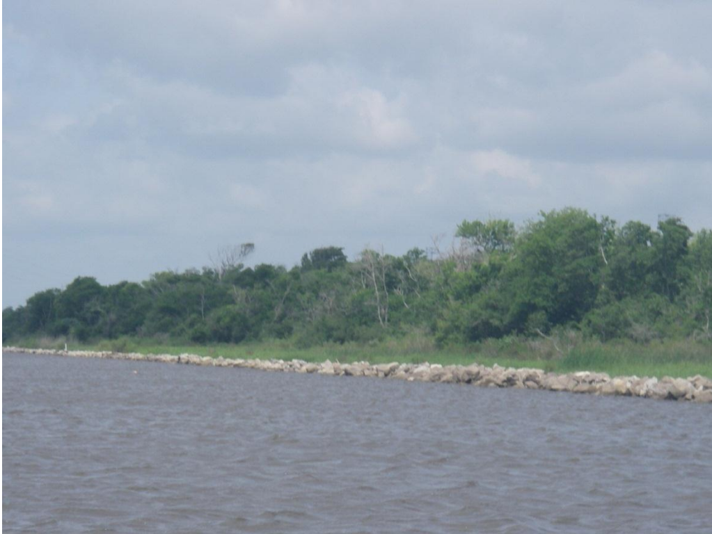
Photo No.3, Vegetation behind Rock Dike