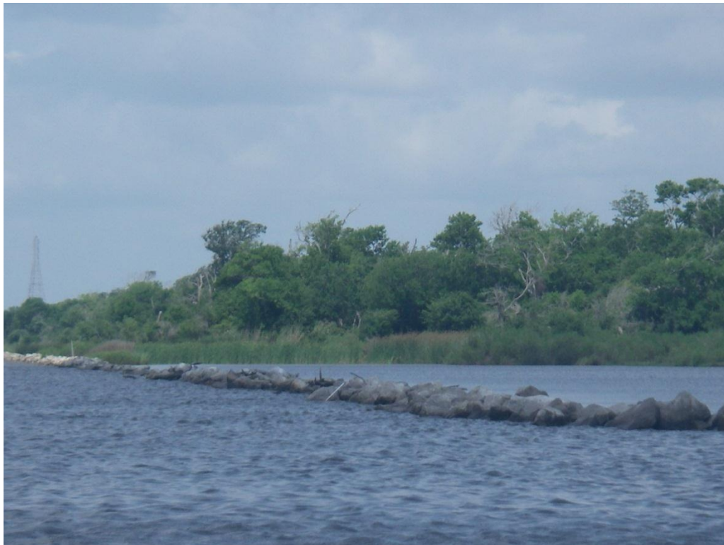
Photo No.2, Accretion behind Rock Dike