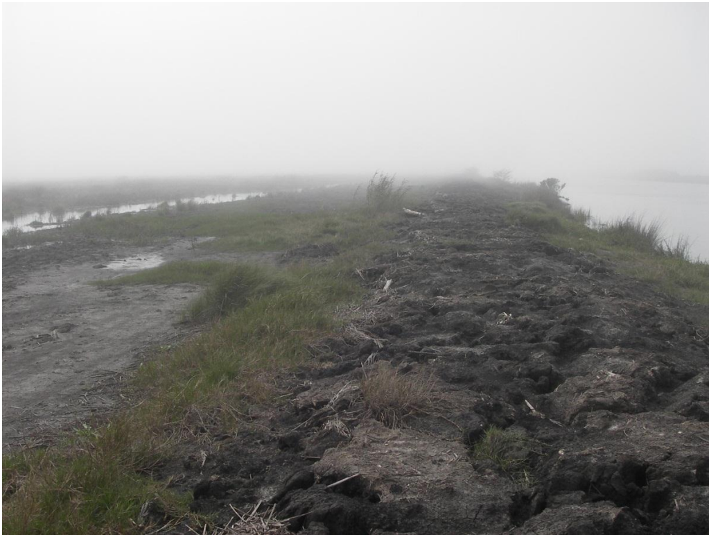
Photo No.2, Containment Dike along Pipeline Canal