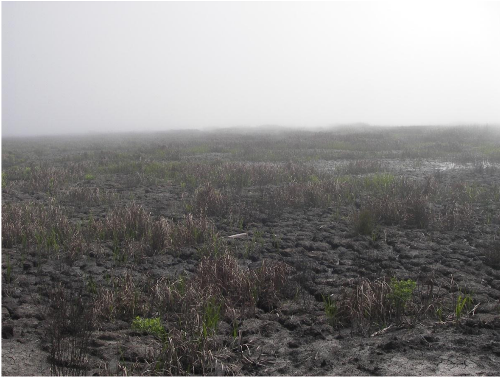
Photo No. 1, Marsh Creation Cell