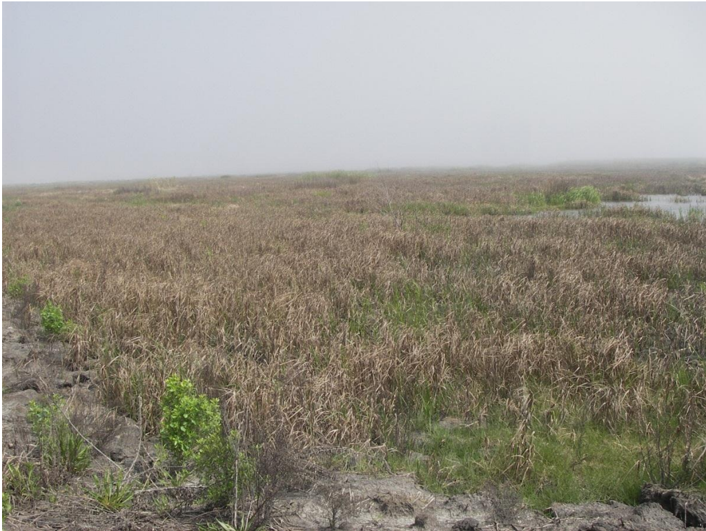
Photo No. 3, Marsh Creation Cell