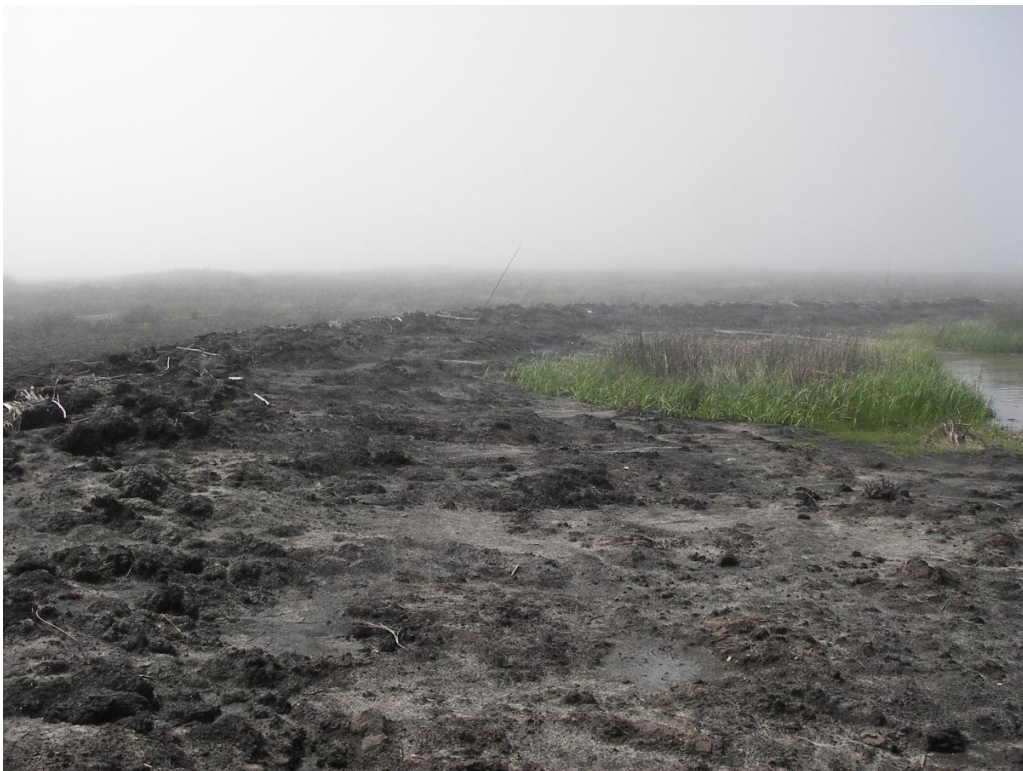
Photo No. 4, Earthen Plug at End of Pipeline Canal.