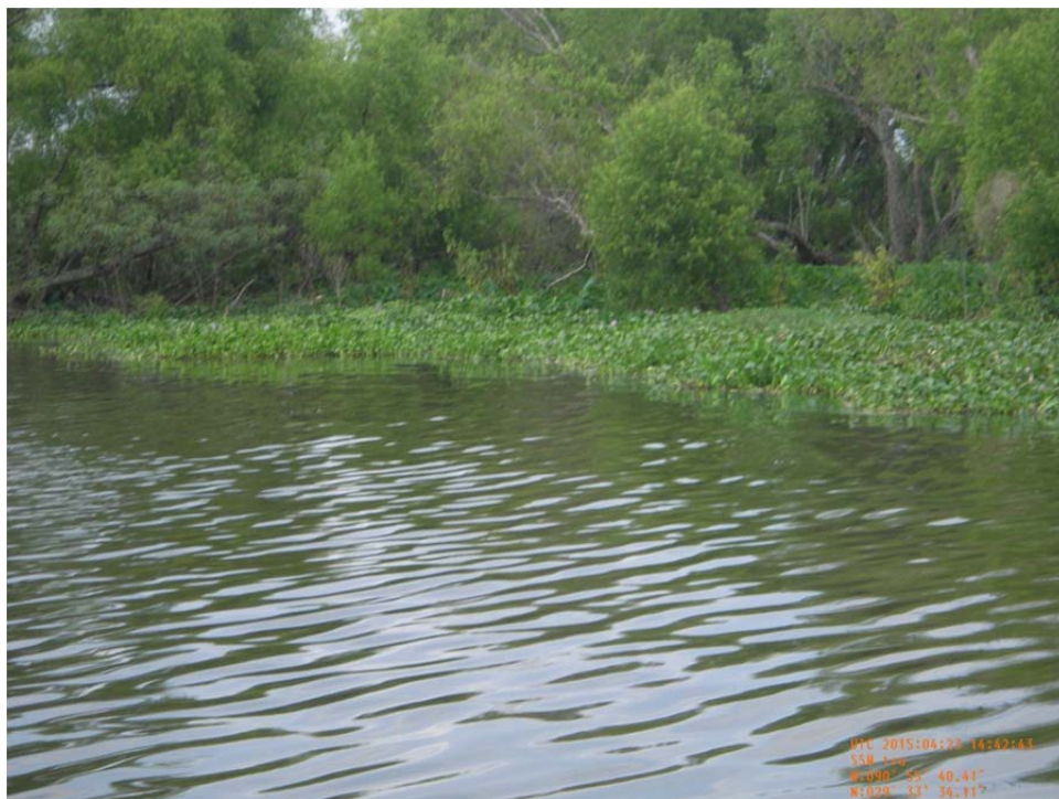
Photo 22: View of rock dike location at the tie-in to the bank at Bayou Copasaw on the east end of the project.