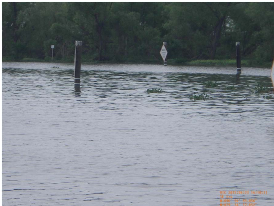
Photo 8: View of the submerged rock dike and warning signs near cove in the bank line (Sta. 16+00).