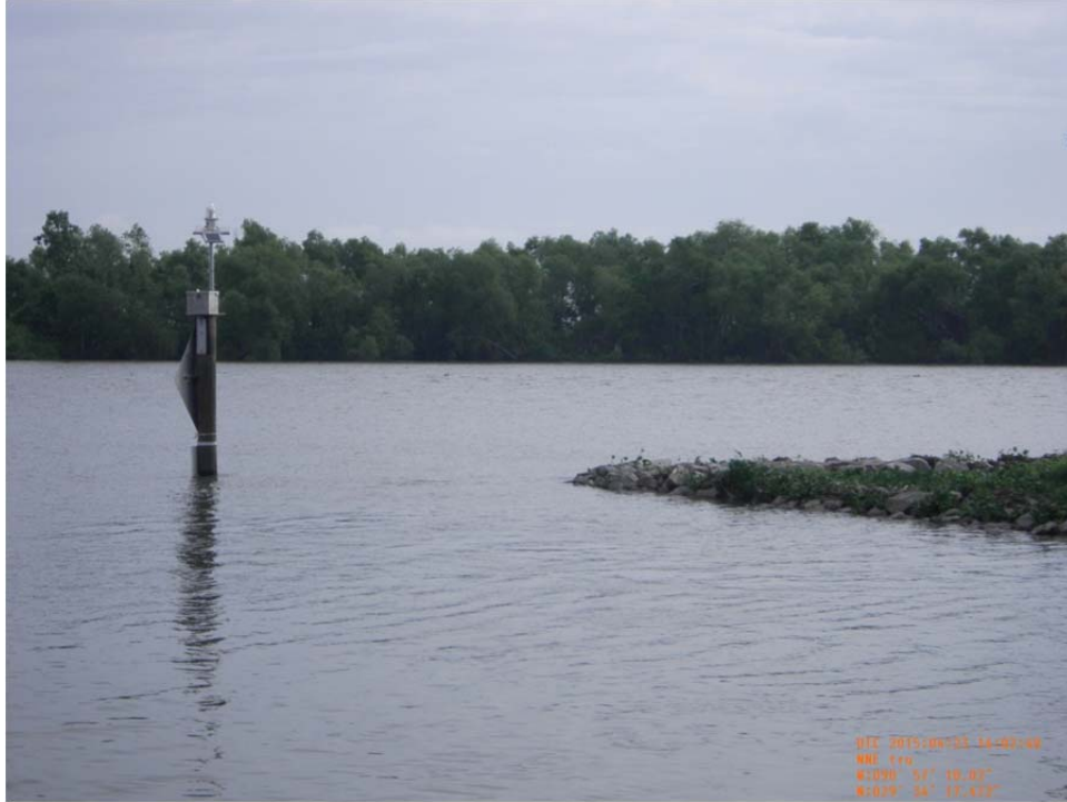
Photo 3: View of permanent warning sign (PS-2) and navigational aid light at the west end of the Breach Closure (TE-43) project.