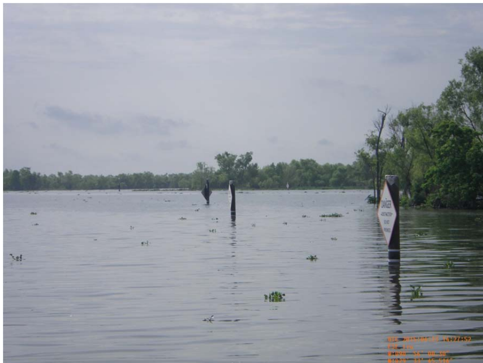
Photo 18: View of warning signs and submerged rock dike near Sta. 80+00 looking east.