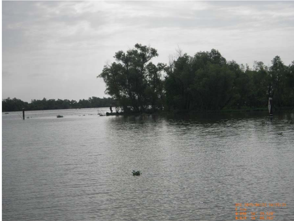
Photo 11: View of the submerged rock dike and bank line near Sta. 37+00 looking northeast.