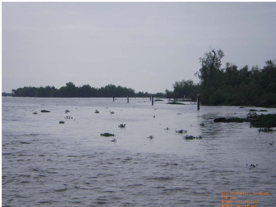
Photo 6: View of the submerged rock dike and warning signs near Sta. 5+00 looking southeast.