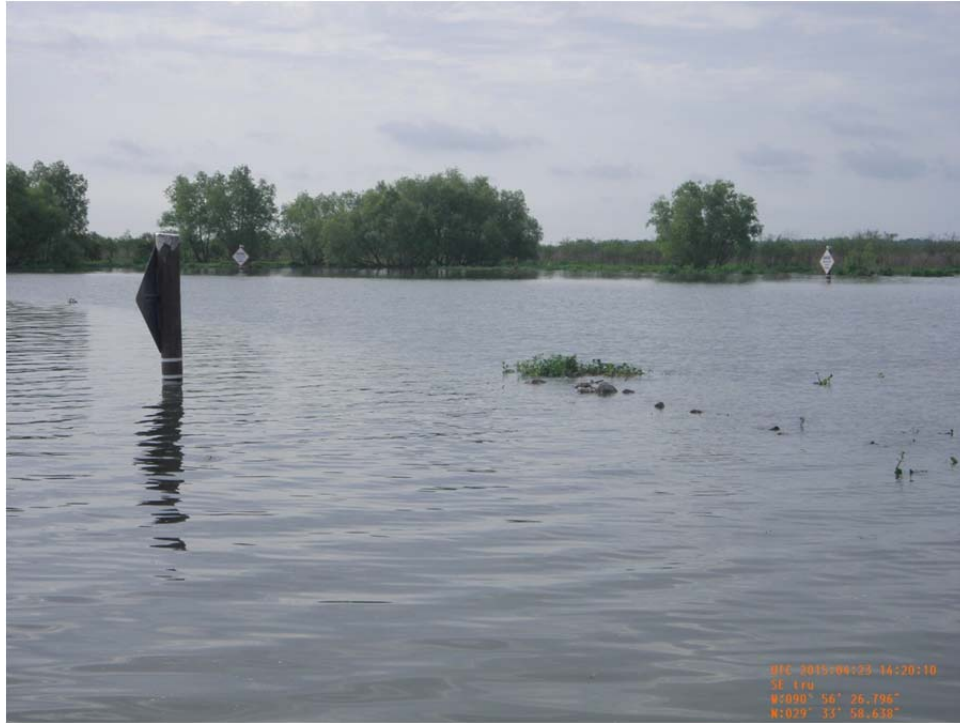
Photo 13: View of submerged rock dike and warnings signs near cove in bank line near Sta. 47+00.