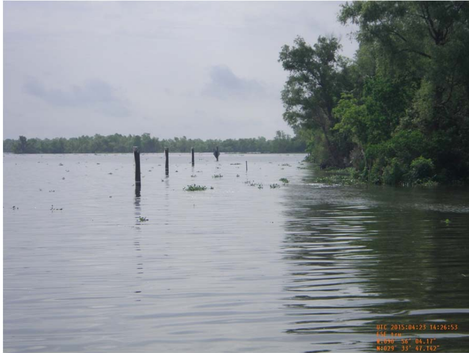
Photo 17: View of warning signs and submerged rock dike near Sta. 77+00 looking east.