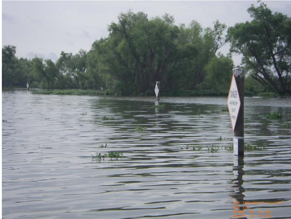
Photo 15: View of warning signs and submerged rock dike near Sta. 65+00 looking southeast.