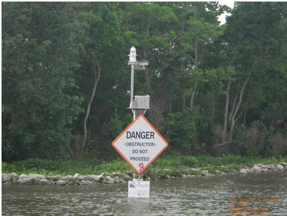
Photo 4: View of the warning sign (PS-2) and navigational aid light at west end of project near Sta. 2+00.