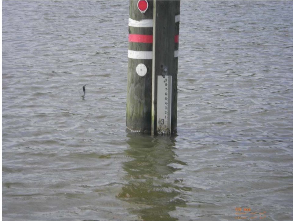
Photo 1: View of the staff gauge on the west end of Segment No.1 of the GIWW CIAP project.