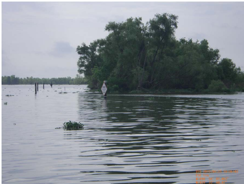
Photo 16: View of warning signs and submerged rock near Sta. 72+00 looking northeast.