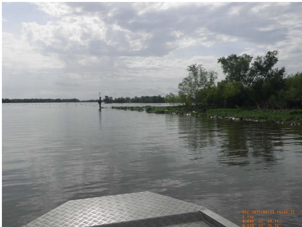
Photo 20: View of rock dike just above water line, warning sign and navigational aid light at the corner of Bayou Copasaw (Sta. 104+50).