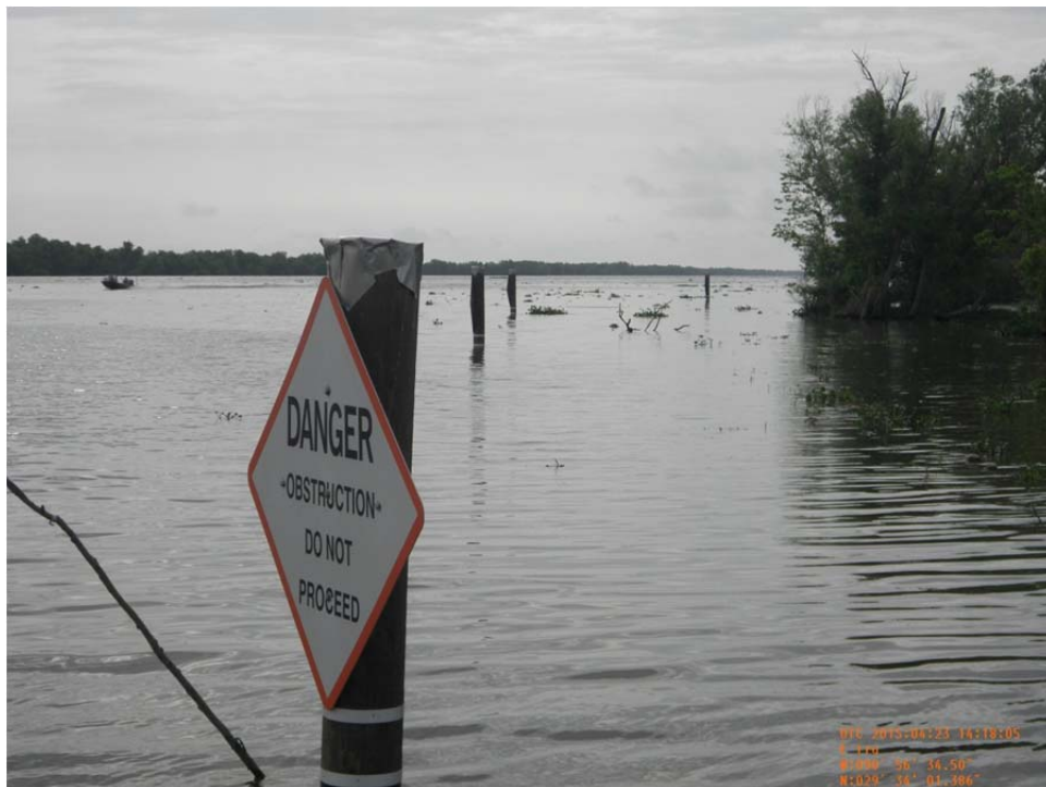
Photo 12: View of warning signs and the submerged rock dike near Sta. 42+00 looking southeast.