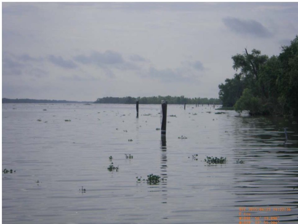
Photo 14: View of the submerged rock dike and warnings signs near Sta. 59+00 looking southeast.