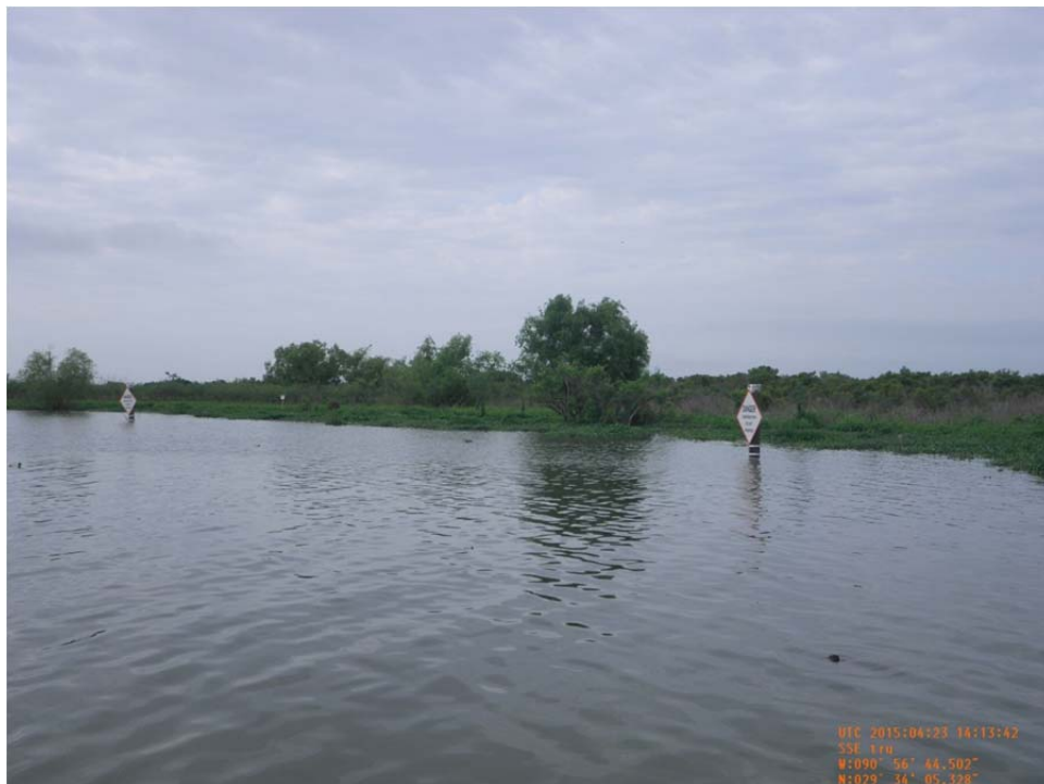
Photo 10: View of the submerged rock dike and warning signs near Sta. 30+00 looking southeast.