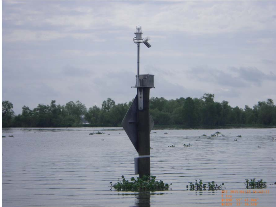
Photo 21: View of warning sign and navigational aid lights (PS-24) near the entrance of Bayou Copasaw on the east end of the project.