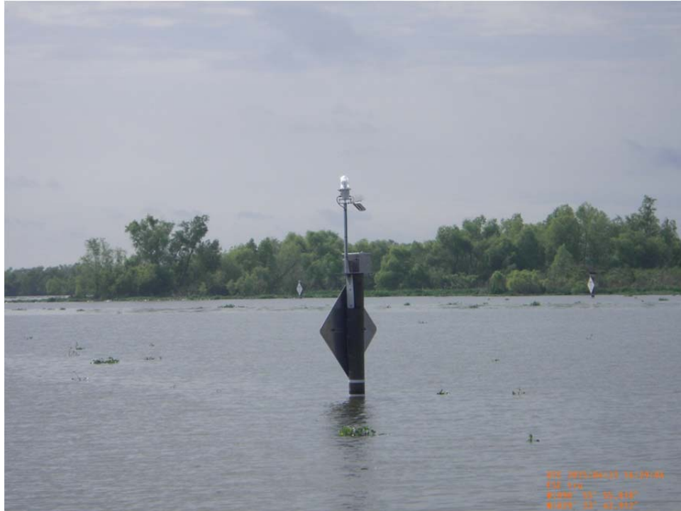
Photo 19: View warning sign and navigational aid lights (PS-20) near Sta. 85+00 looking southeast.