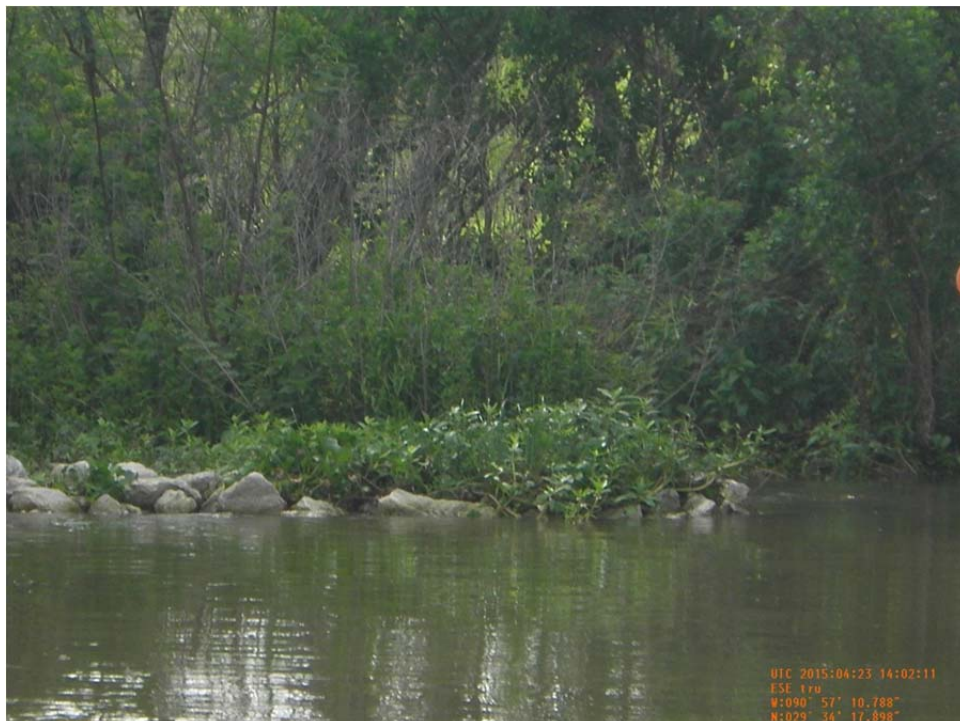
Photo 2: View of the rock dike tie-in on the west end of the GIWW Breach Closure Project (CWPPRA) at the entrance of the Copasaw Canal.