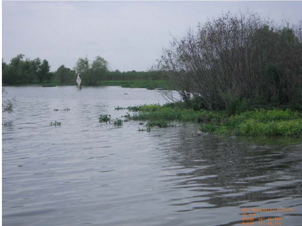
Photo 9: View of the submerged rock dike and warning sign near Sta. 29+00.