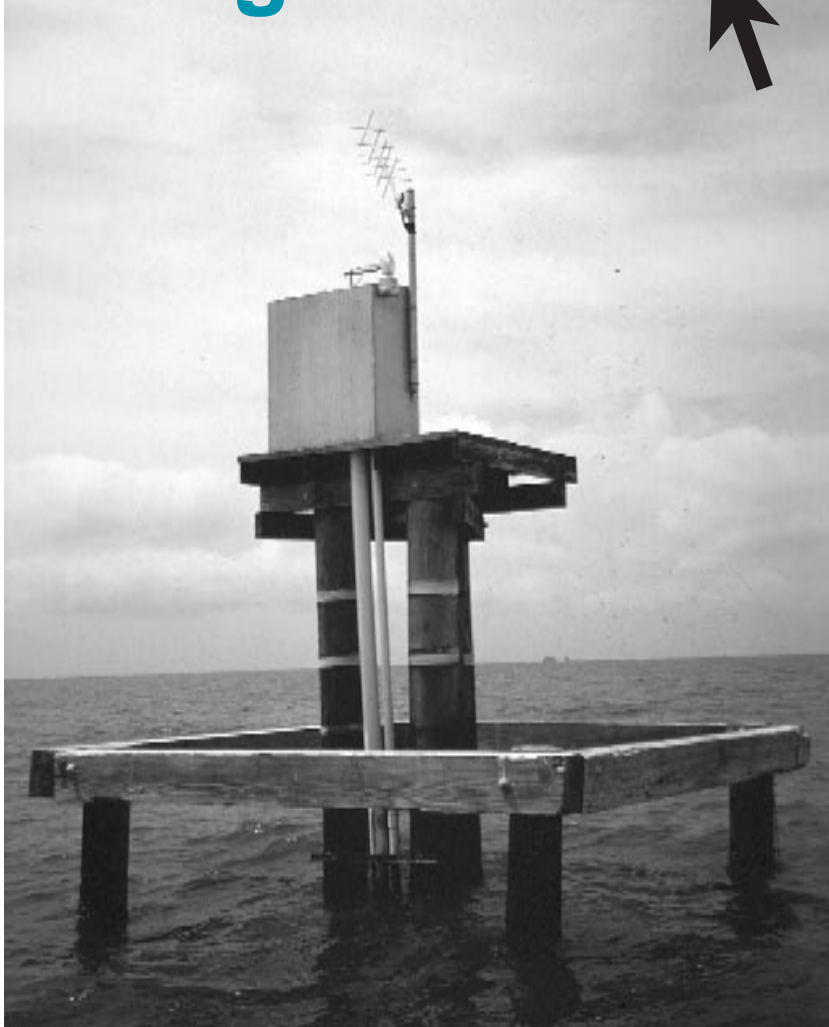
One of the Department of Natural Resources' real-time data collection platforms. Data collected by the sensors at the base of the platform are relayed via satellite to DNR in Baton Rouge.

One key aspect of technology at work in the wetlands is playing an important role for the Louisiana Department of Natural Resources (DNR). Teamed with the U.S. Geological