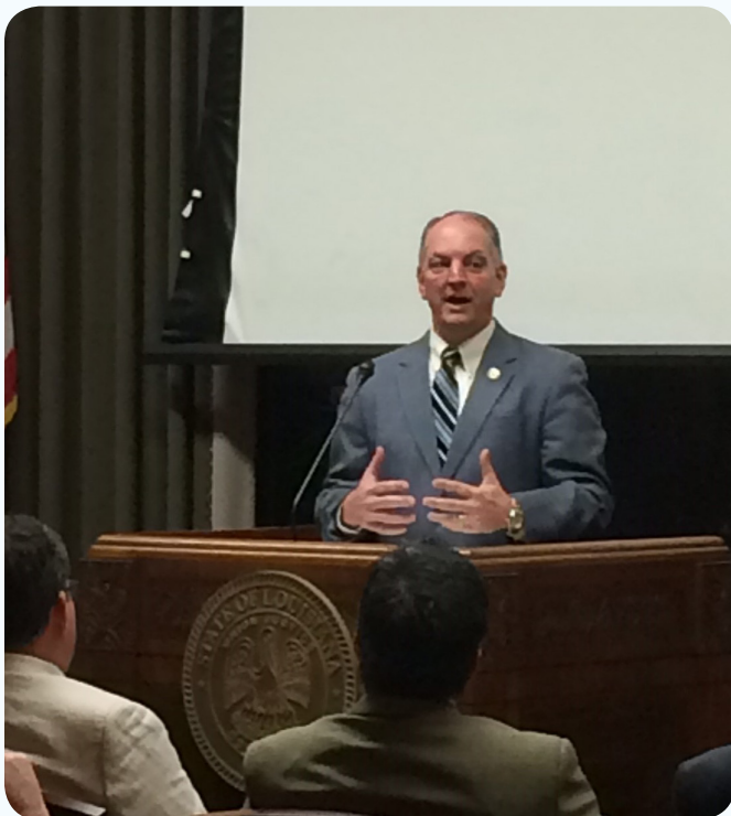
Governor Edwards issues an executive order.

outreach staff had the honor of being present during a meeting in which Governor Edwards issued an executive order directing all state agencies to operate in a manner consistent with the Coastal Master Plan. (continued on page 2)