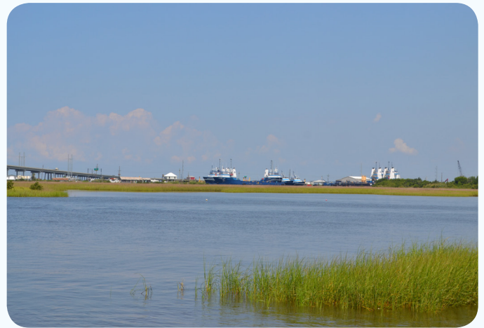
The East Leeville Marsh Creation and Nourishment project would restore the structural framework of marshes to promote coastal wetland habitat and afford some protection for the community of Leeville.

After consideration of three potential alternatives, features and an alignment were selected to establish an arc of wetlands along the north side of Southwestern Canal, Lake Jesse, and the west side of South Lake. This is to begin rebuilding the structural framework of wetlands east of Leeville and provide protection for Leeville from southeasterly winds and tides. A robust engineering and design cost was included for full flexibility during Phase 1 to expand the project if cost allows or to assess alternative configurations, if necessary. The proposed features consist of hydraulically mining sediment from a borrow source in Little Lake west of Leeville and pumping dredged material to create and nourish marsh east of Leeville. The disposal areas would be fully contained during construction and gapped no later than three years post construction to facilitate establishment of tidal connection and function. Additionally, a portion of the created marsh acres would be planted with smooth cordgrass following construction to help stabilize the created platform by increasing the rate of colonization.