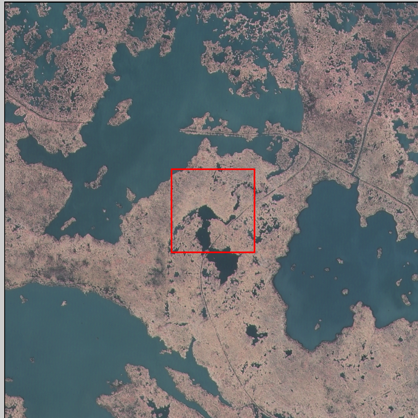
2005 Digital Image