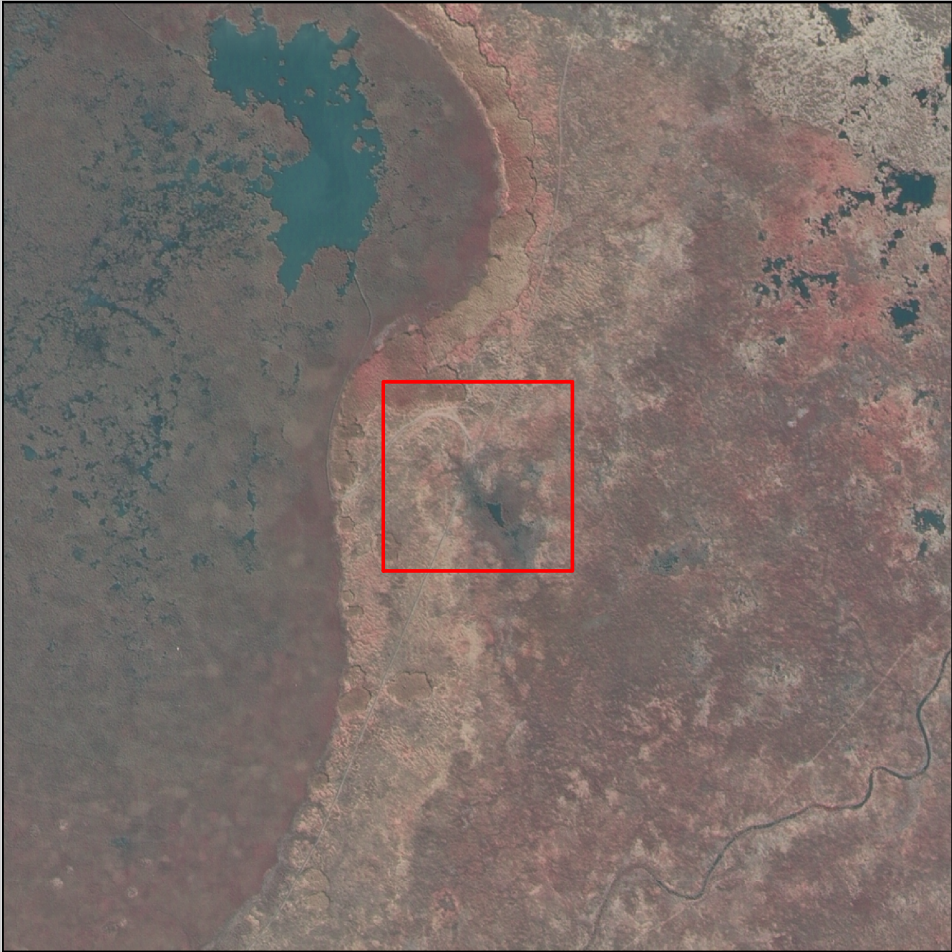
2005 Land-Water Analysis