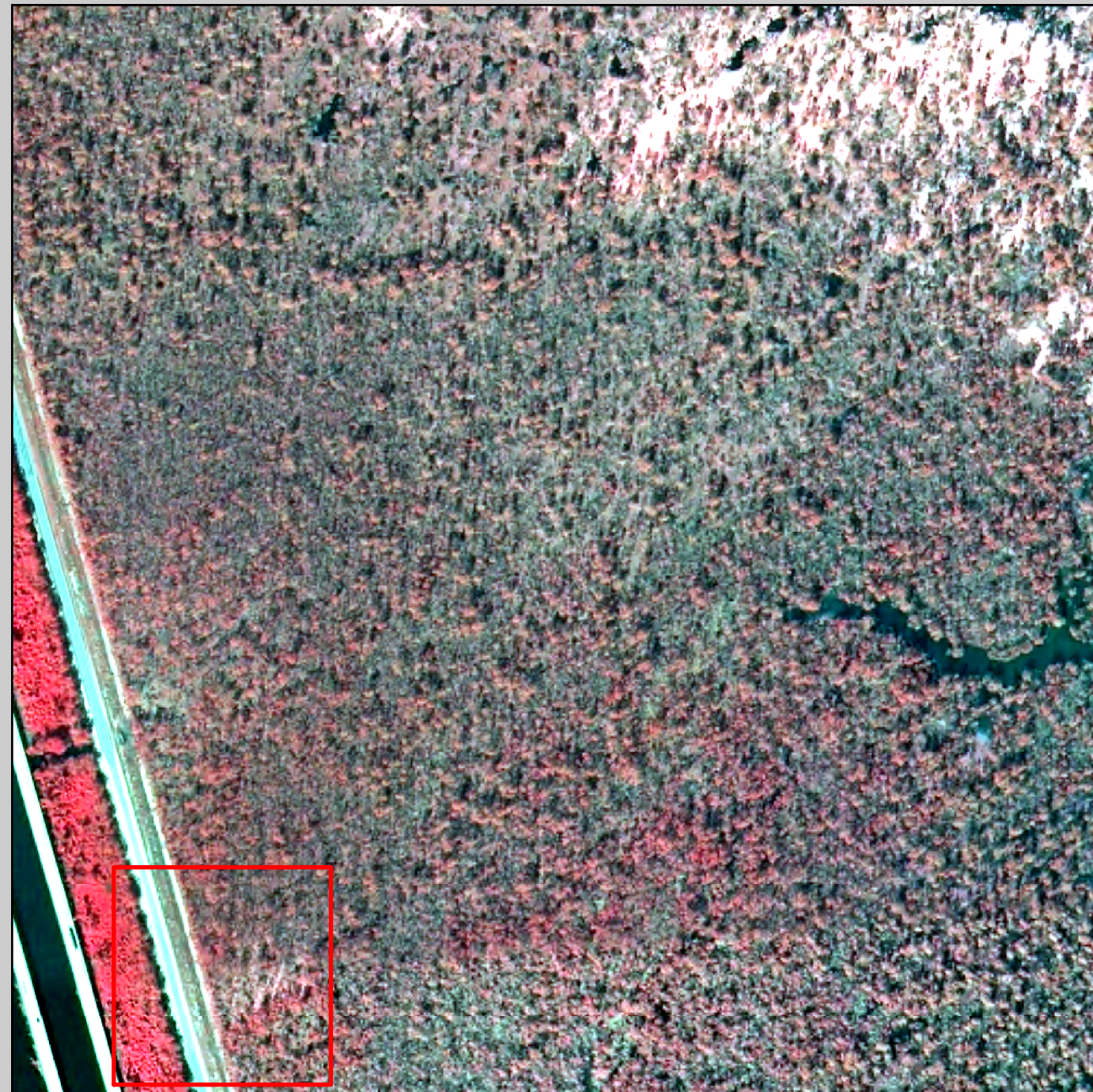
2005 Land-Water Analysis