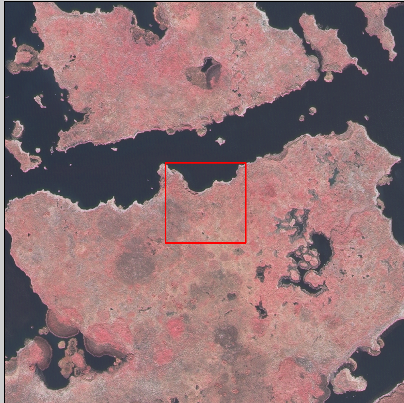
2005 Digital Image