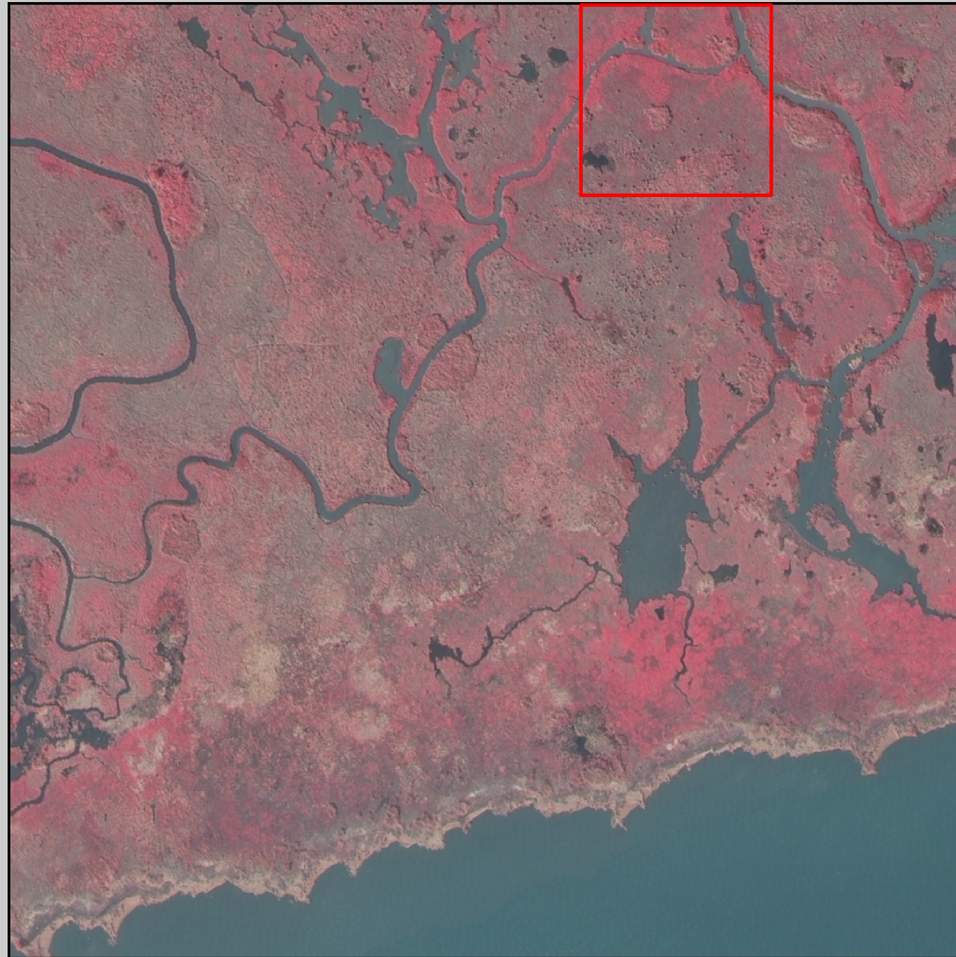
2005 Digital Image