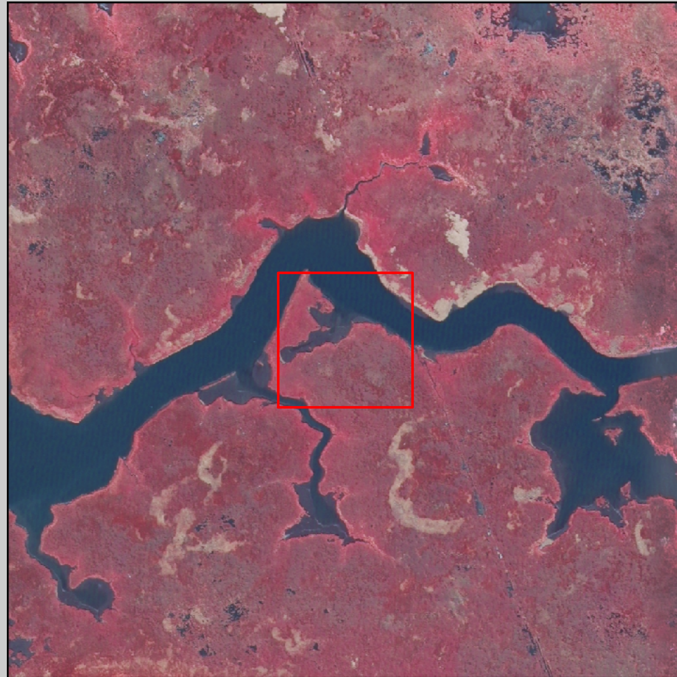
2005 Digital Image