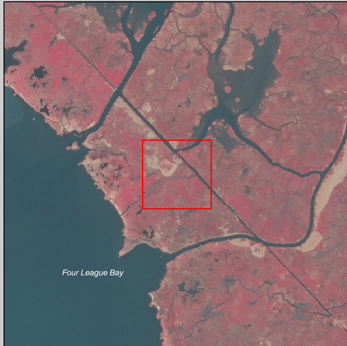
2005 Digital Image