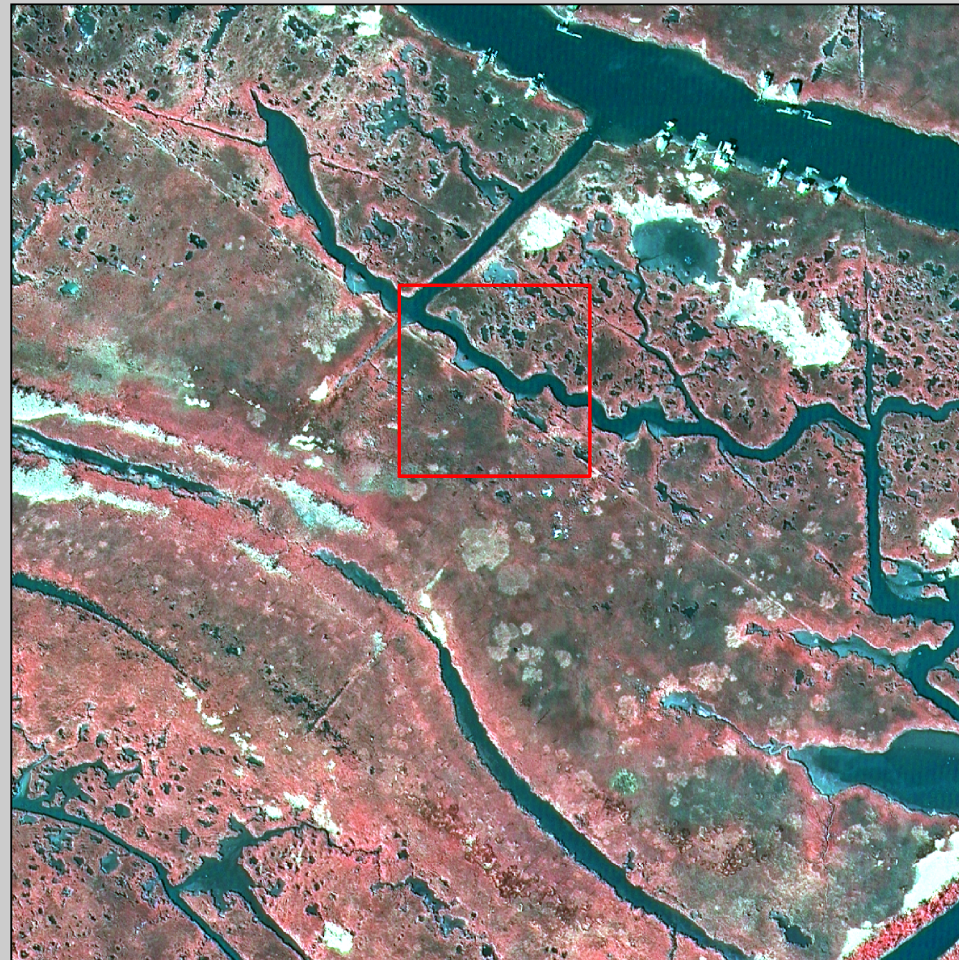
2005 Land-Water Analysis